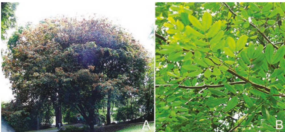
Fig. 3. The Lawn XJ Sindora (S11) at SBG. A. Habit and form of the tree. B. Close-up of the leaves.

Lawn XJ. A Sindora wallichii tree (S11, Table 1, Fig. 3) was recorded from Lawn XJ (then Lawn XH) in Turner (1990). Eyewitness accounts from K.B.H. Er and photographs from 2004–2005 (Fig. 3) confirm the existence and location of this tree, but unfortunately its identity cannot be confirmed as there are no herbarium specimens available. The tree fell during a storm in 2018.