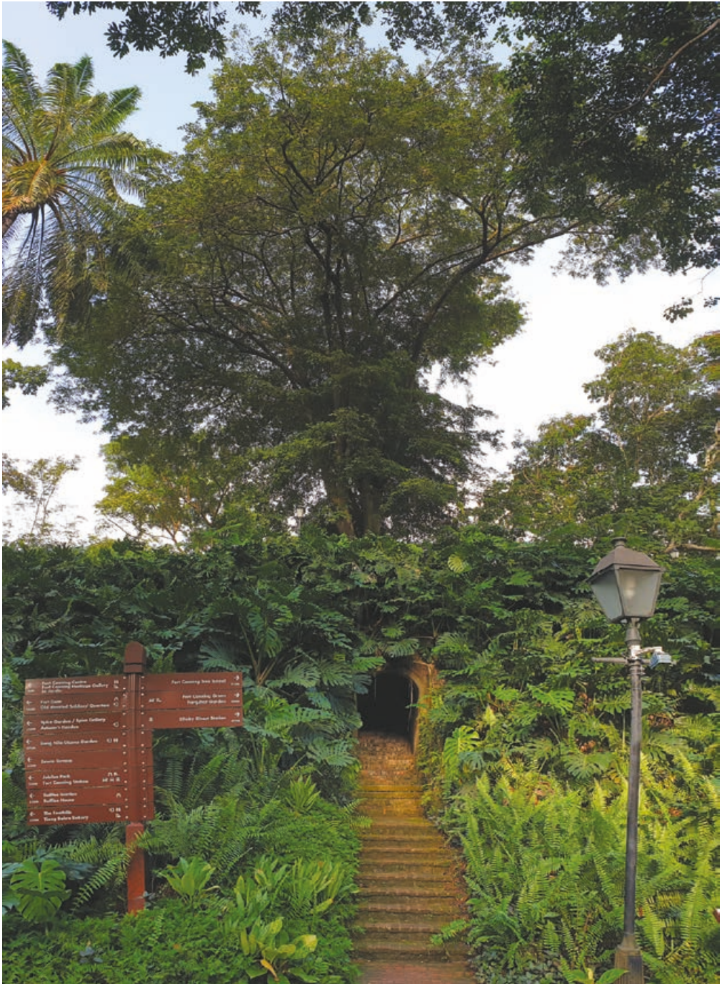
Fig. 5. The Sally Port Sindora siamensis (F1) at FCP, as seen from the entrance of the Sally Port.