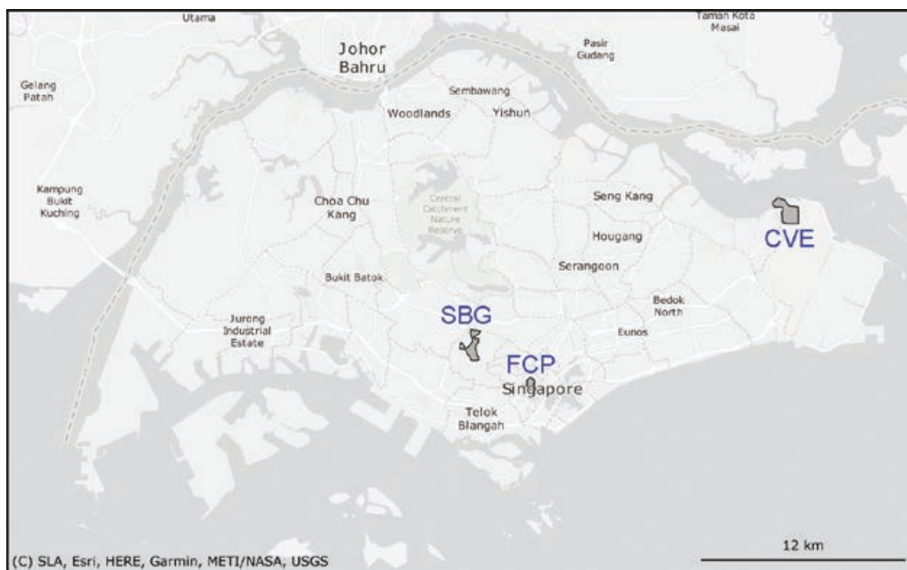
Fig. 1. Map of Singapore, with SBG, FCP and CVE indicated by the shaded areas.