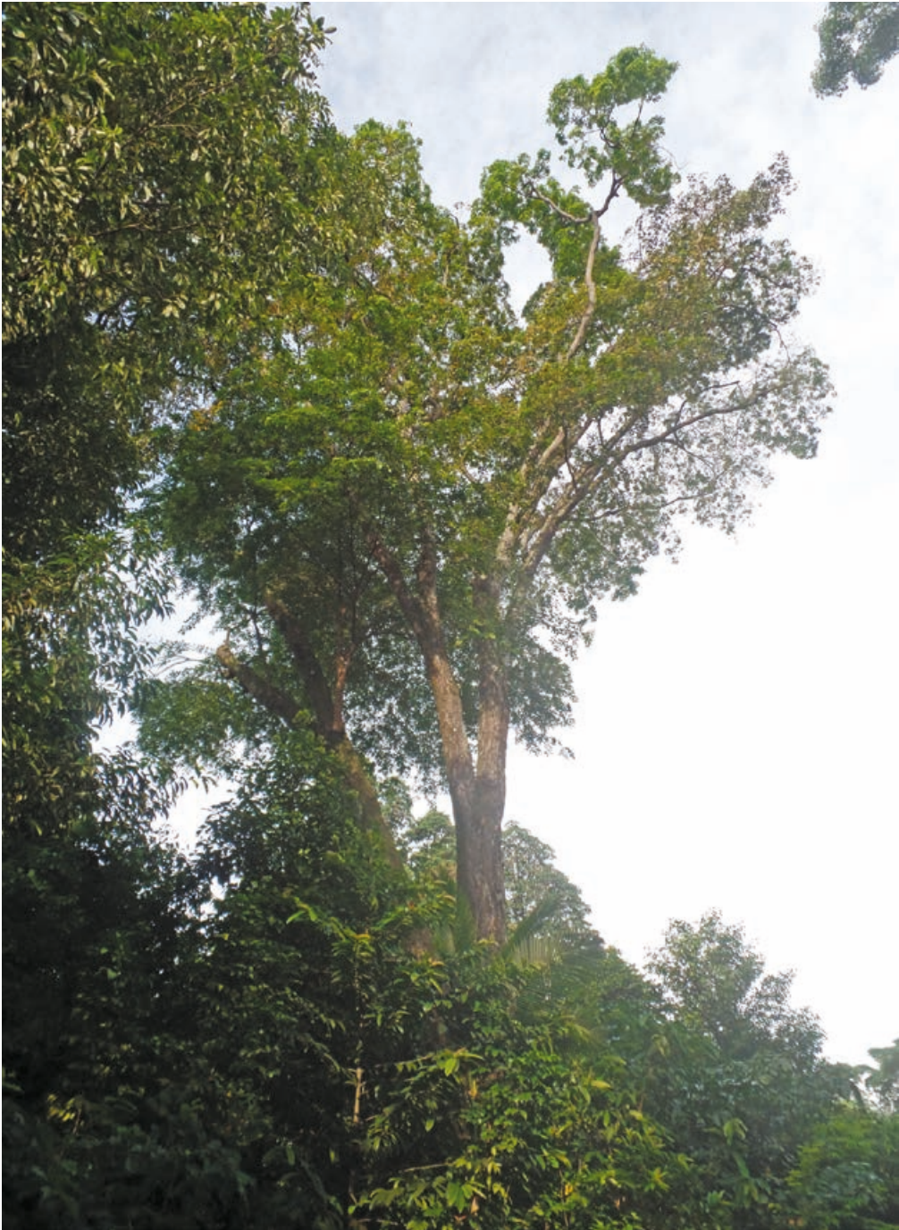
Fig. 4. The Lawn T Sindora siamensis (S15) at SBG, as seen from Burkill Drive leading down from Burkill Hall.