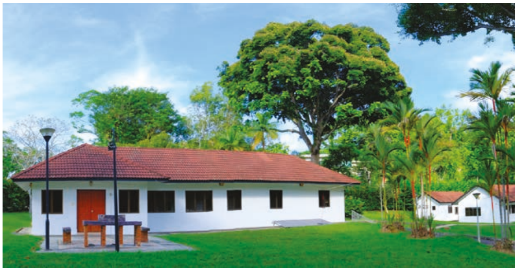
Fig. 6. The CVE Sindora × changiensis at Cranwell Road, pictured in the middle between the Cranwell Bungalow buildings.