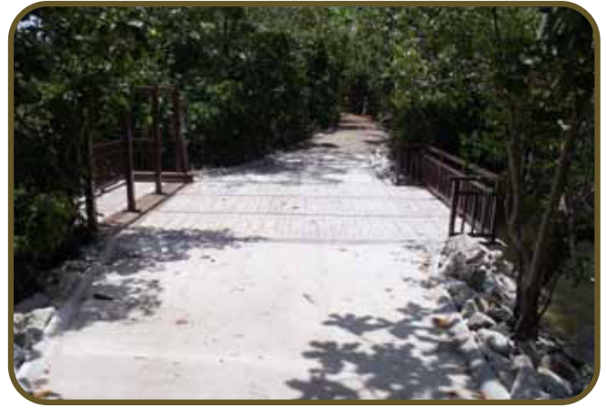
The level of the sluice gate has been raised after completion.