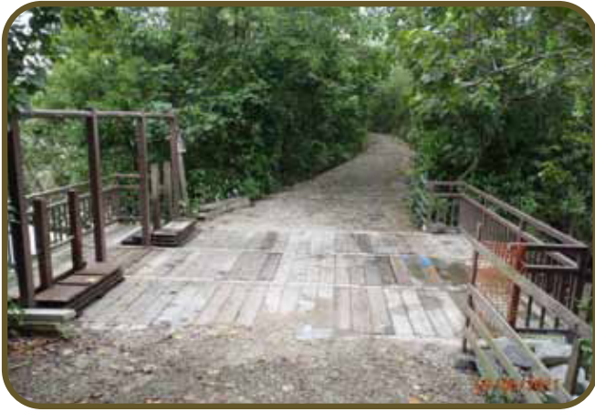
The sluice gate was lowered due to wear and tear.

As part of our reserve management, sluice gates are used in Pulau Buloh to control the water levels of our ponds. Some of these gates have been lowered due to wear and tear, and are occasionally flooded at high tides. Work was done to raise their levels. Additionally, some of the gate panels have become too weathered to keep out water completely, so these will be replaced.