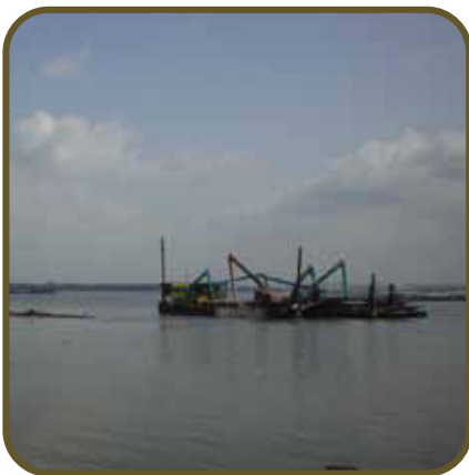
View of the work area, where a breakwater is being constructed.

A breakwater is being installed off the northeast corner of Pulau Buloh to reduce the effects of erosion caused by the waves. This consists of stones laid up to 2.9m above mean sea level, over a base made up of geotextiles (fabrics which can reinforce the structure) and concrete piles. The breakwater should create a deposition zone (an area where sediment collects naturally) behind it to eventually support mangrove growth. Mangrove saplings will be planted at the breakwater as well.