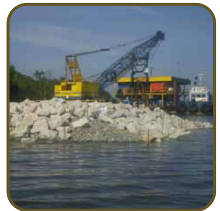
Next comes the laying of rocks, up to 2.9m above sea level.