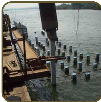
The first step to building a breakwater – inserting piles into the sea bed.