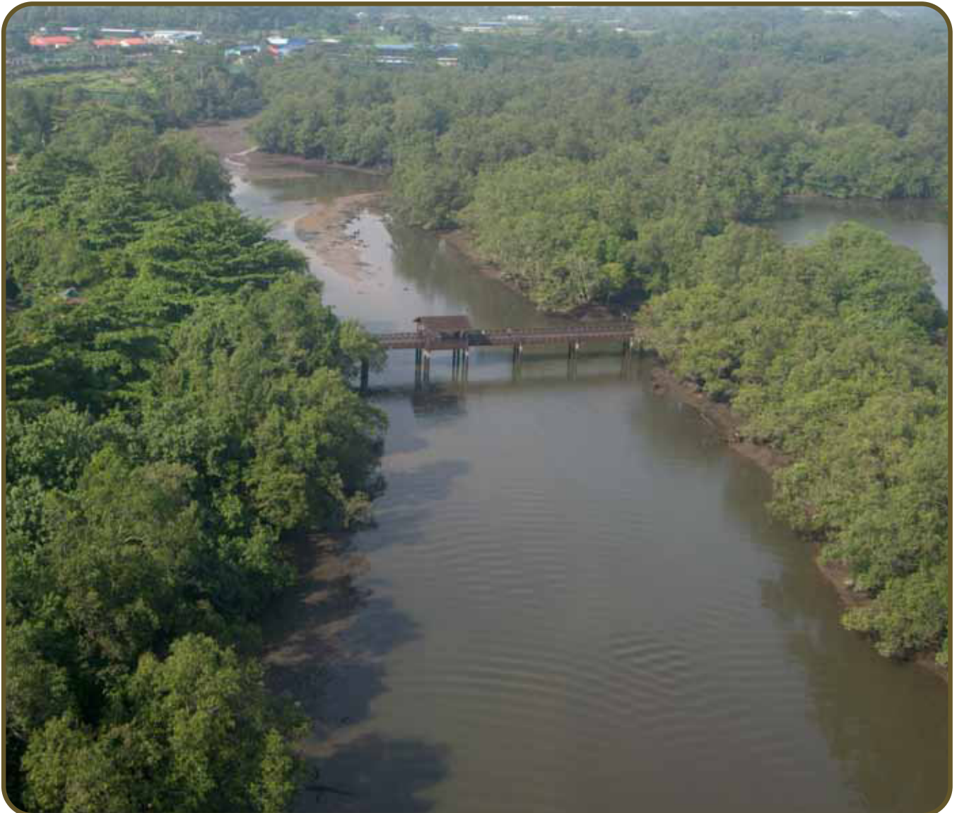
An aerial view of the Sungei Buloh Besar, along which the repairs to the sluice gates were made.