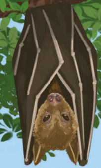
Lesser Dog-faced Fruit Bat