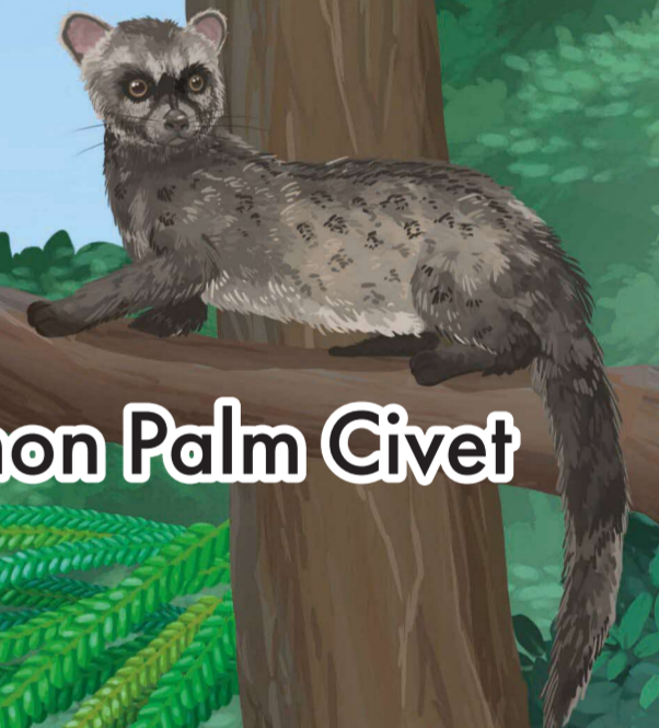
Common Palm Civet