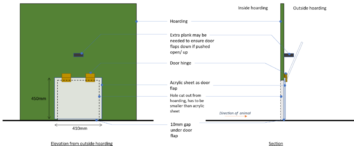
Sketch of one-way wildlife exit

Clearance is broken up into two stages, 1) understorey clearance of shrubs and trees not exceeding 1 m girth, followed by 2) tree felling, with a minimum three-day fallow period between the two. If an excavator is used for undergrowth clearance, a worker should be stationed in front of the excavator to moderate the speed of the machinery. The worker should also observe for fauna or holts and burrows that may be in the excavator's path and signal to the excavator operator to stop work if required. Clearance should only continue after animals have been ushered out of site. Following this, sites should be left fallow minimally for 3 days and pre-felling checks (Table 1) are to be done before removal of trees on site. The site should then be completely hoarded up with no gaps to prevent re-entry, and permanent fencing is to be installed at perimeter if not already done so. This process is to be repeated for all subzones of the work site. Any waterbody or potential shelter such as culverts at site should be fenced off temporarily and horticultural waste should be removed on the same day to avoid drawing wildlife back into the clearance zone (City of Ottawa, 2014).