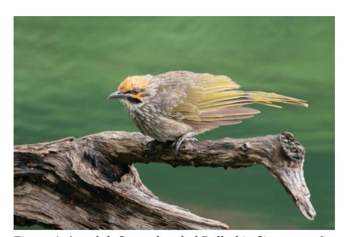
Figure 1. An adult Straw-headed Bulbul in Singapore.

The Straw-headed Bulbul is the largest bulbul in tropical Asia, measuring around 29cm in length and weighing more than 80g (Strange, 2000; Singapore Birds Project, n.d.; Yong et al., 2017; Fishpool et al. 2020). Adults have a golden-yellow forehead, crown, lores, and ear-coverts, with prominent black eye lines and submoustachial stripe (Kumar, 2018; Singapore Birds Project, n.d.; Yong et al., 2017; Figure 1). They also have a whitish throat and greyish-brown nape, mantle, upper back, and breast, with whitish streaks – a pattern that continues down to the abdomen, where the streaks become paler and less striking. Their wings, tail, and rump are olive-green, though the colour is more pronounced in the outer webs of the wing and the upper-tail coverts. Both legs and claws are black.