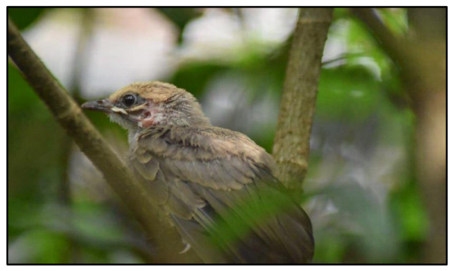
Figure 2. A 15-day old juvenile Straw-headed Bulbul at Singapore's Jurong Bird Park.

Straw-headed Bulbul chicks have black irises for about six months, before turning dull grey, dull brown, and eventually bright red after about a year and a half (Kumar, 2018).