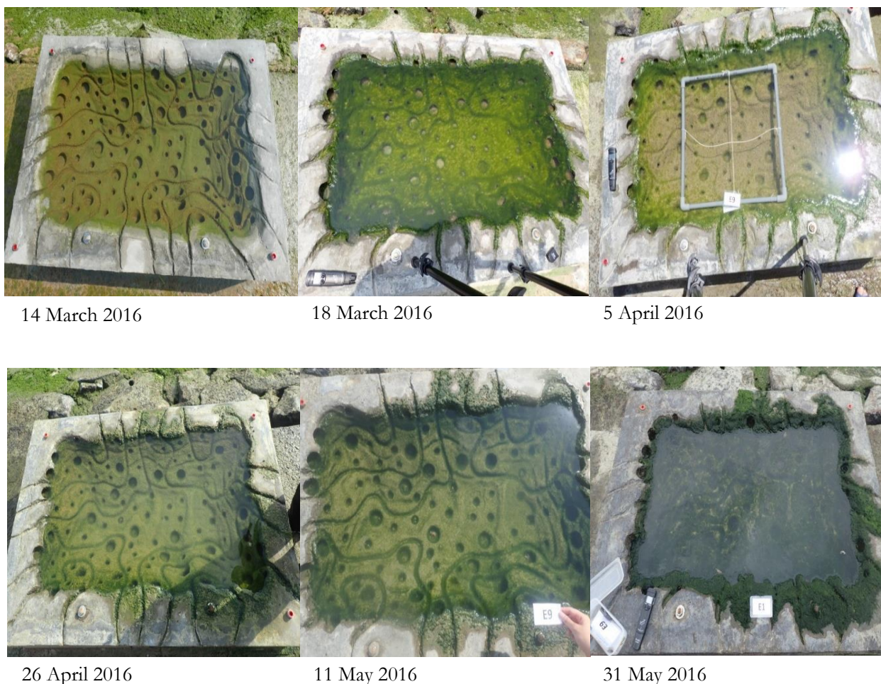
Figs. 4. Succession in unit E9 with contour designs.

The units were monitored fortnightly to gather data on the recruitment and succession of fauna and flora, as well as environmental parameters such as temperature, conductivity, and irradiance. We engaged a group of students from Nanyang Technological University to monitor and document the performance of the tidal pool units. Preliminary results indicated that the tidal pools were occupied by turf algae within the first week after installation and, shortly after, this single species was replaced by an assemblage of algae including Bryopsis spp., Dictyota sp., Enteromorpha spp., Ceramiales spp. and Ceramium spp. (Fig. 4). Fauna diversity and abundance increased over time and, after several weeks, we recorded periwinkle and nerite snails, crabs, tube and fire worms, feather stars, sponges, bead anemones, and even cuttlefish (Fig. 5). The performance of each tidal pool design and its complexity elements were also being monitored. The outcomes of this study were expected to provide a more comprehensive understanding of the combination of complexity treatments on species recruitment and biodiversity.