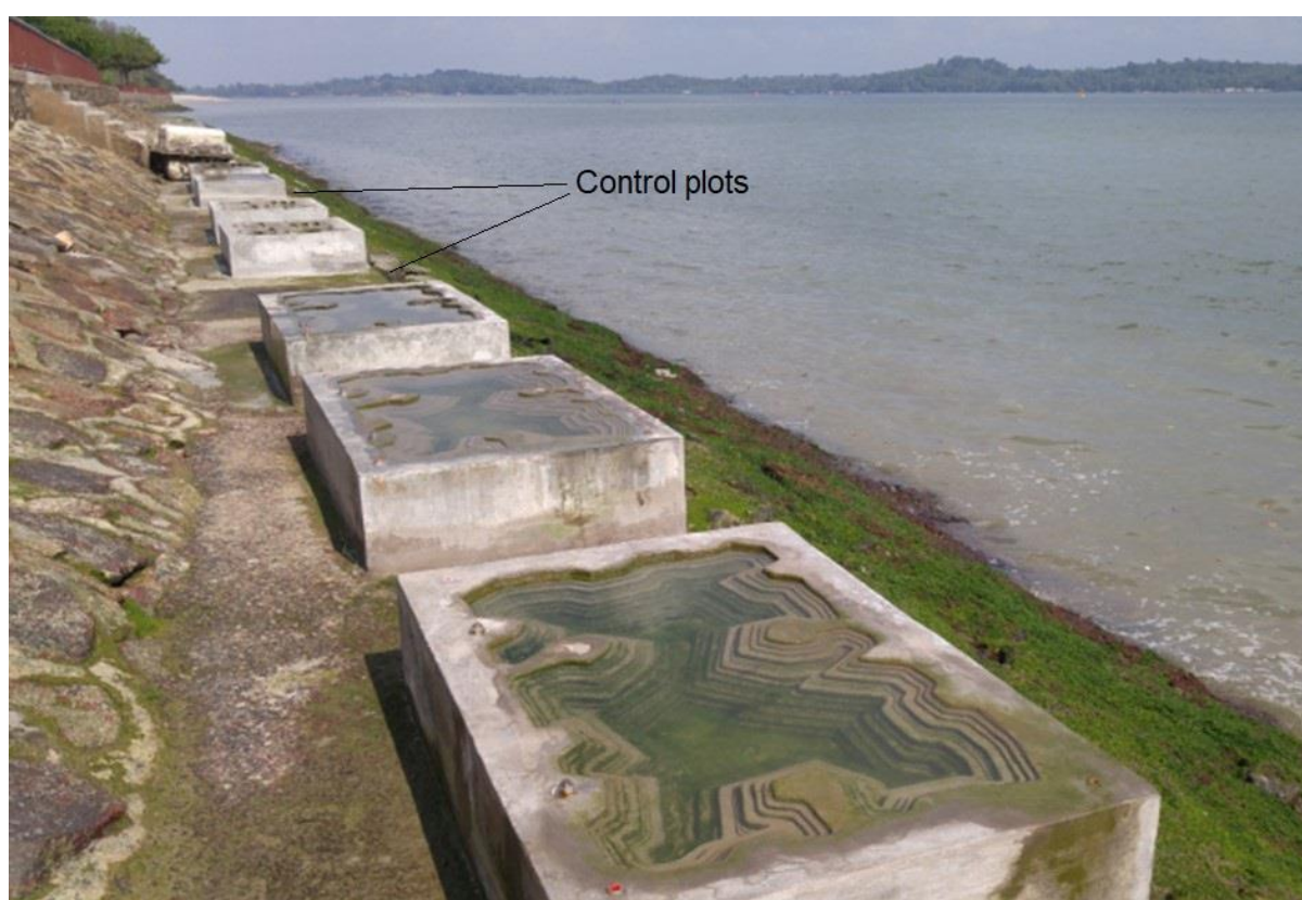
Fig. 3. The tidal pool units positioned in a randomised layout with control plots (empty slot without any tidal pool unit).

We looked at the relationship between the tidal pool designs and community assemblage and succession by assessing their ability to provide shade and regulate temperature using drained and un-drained units. To reduce bias and account for treatment or site effect, we positioned the different design configurations randomly along a linear stretch of seawall and introduced control plots to assess the effectiveness of introduced structures versus no modifications. Control units in this context were empty plots on the seawall that were of the same size as the tidal pool units (Fig. 3). Data collected on these control plots would act as a baseline against which the treatments/modifications would be compared.