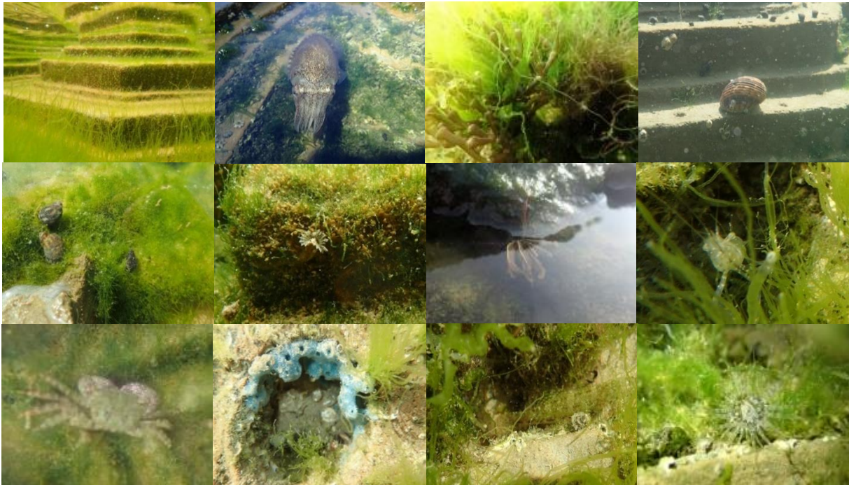
Figs. 5. Marine organisms recorded in the tidal pool units.