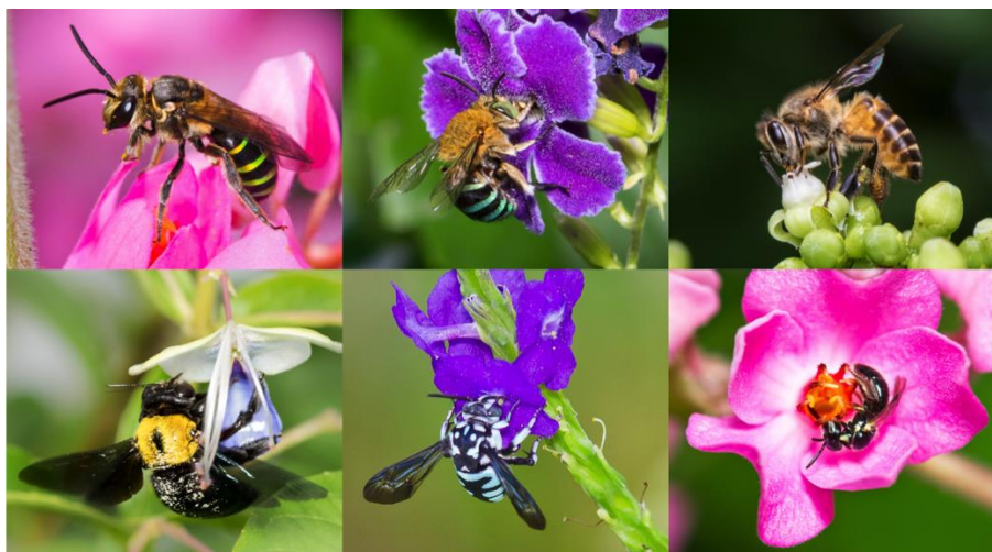
Figs. 2. Bee-attracting flora in the Butterfly Garden.