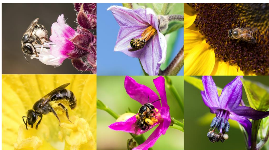
Figs. 3. Bee-attracting flora in the Edible Garden.