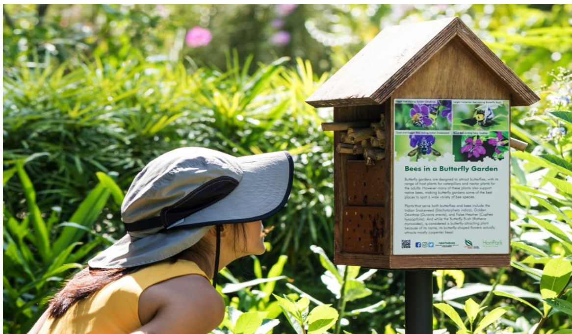
Fig. 4. Frame installed with bee hotel showing the interpretative sign.

Seven frames were installed with bee hotels. Inside the eighth frame, we placed a box hive of Valdez's Stingless Bees ( Tetragonula valdezi ) that had been rescued from an abandoned fridge. This harmless native species is common and naturally occurring at HortPark. We also set a disused upturned plant pot containing a hive of the same stingless bee species along the trail. Both the bee hotels and the stingless bee hives allowed visitors to safely observe bees that are lesser known and often overlooked by the public.