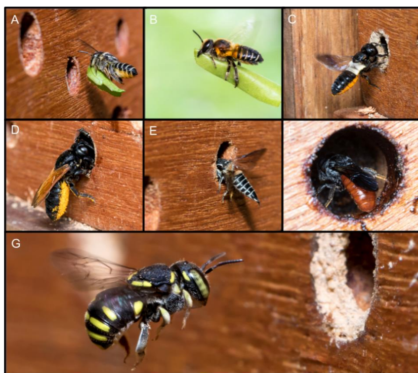
Figs. 6. Bee occupants of the Bee Hotels along the HortPark Bee Trail: (A) Golden-bellied Leafcutter ( Megachile tricincta ); (B) Broad-headed Leafcutter ( Megachile laticeps ); (C) Disjunct Resin Bee ( Megachile disjuncta ); (D) Orange-winged Resin Bee ( Megachile fulvipennis ); (E) Confusing Sharp-tailed Bee ( Coelioxys confusus ); (F) Asian Chilli-tail Bee ( Euaspis polynesia ); (G) Smith's Rotund-Resin Bee ( Anthidiellum smithii ).

Occupants were seen in only four of the seven bee hotels along the trail over the one-year monitoring period. These active hotels were under semi-shade, whereas the three empty hotels were under full sun – a crucial learning point for future siting of bee hotels. Nonetheless, the four active bee hotels were utilised by seven species of Megachilid bee for nesting (Fig. 6), four of which are new bee records for HortPark. The most significant bee found was Anthidiellum smithii (Fig. 6G), a rare solitary bee species that was last recorded for Singapore in 2015 in the vicinity of Bukit Timah Nature Reserve (Soh & Soh, 2020). We also observed and documented for the first time two rare instances of cleptoparasitism by native cuckoo bees: the first instance being Coelioxys confusus (Fig. 6E) on Megachile tricincta (Fig. 6A), and second being the rare Euaspis polynesia (Fig. 6F) on the uncommon Megachile fulvipennis (Fig. 6D). These observations demonstrate that bee hotels in Singapore may not only support common species (such as Megachile laticeps and Megachile disjuncta ), but rare ones as well.