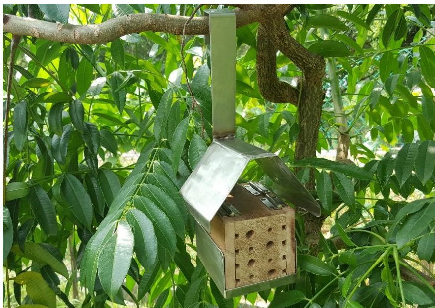
Fig. 7. A bee hotel provided to community gardens.

The monitoring of the trail's bee hotels had provided insights in informing how bee hotels should be set up to maximise usage by bees. The information had been used in a new bee hotel programme for community gardens, launched by Community-in-Bloom. All participating gardens would receive a bee hotel that they could set up and monitor to provide more data on bee habitat enhancement.