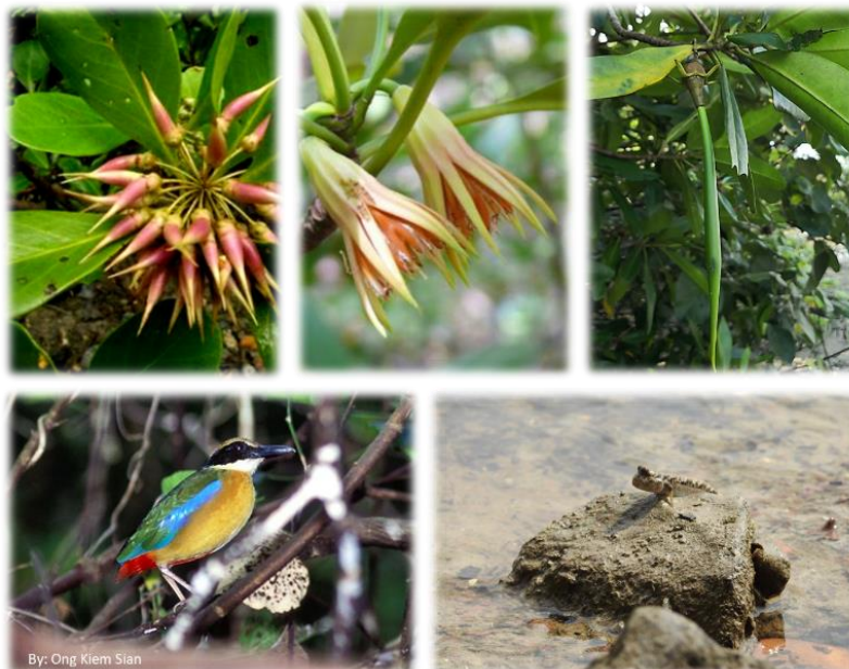
Fig. 1. Rich flora and fauna biodiversity of Pulau Tekong mangrove.

The 92 hectares of mangroves on the northeastern coastline of Pulau Tekong represent one of the largest tracts of pristine mangrove forests remaining in Singapore, which include Sungei Buloh Wetland Reserve and Pulau Ubin. It supports a rich diversity of plants and animals (Fig. 1), and has some of the rarer mangrove species such as Bruguiera parviflora (Endangered), Aegiceras corniculatum (Endangered) and Kandelia candel (Critically Endangered). It is also home to the only natural population of Tumu Putih ( Bruguiera sexangula ), which is a true mangrove species previously thought to be extinct in Singapore, and the Mangrove Pitta ( Pitta megarhyncha ), which is a locally critically endangered bird species. Due to its high biodiversity significance, the area has also been designated as a Nature Area under Urban Redevelopment Authority's (URA) Special and Detailed Control Plan.