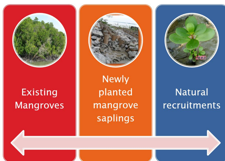
Fig. 5. Three main components of the EMMP involving the monitoring of 1) Existing mangroves, 2) Newly planted mangrove saplings and 3) Natural recruitments.

Besides ensuring that the construction works caused minimal damage on-site, surveys of existing mangroves were also conducted to monitor the health of the mangroves and to establish whether there had been any detectable changes or impacts as a result of the changes to the pattern of tidal exchange within the mangrove habitat and across the shoreline in comparison to the baseline survey results. The surveys provided useful and relevant additional information about the biodiversity and ecology of the existing mangroves in Pulau Tekong. The existing mangrove survey comprised the following components: