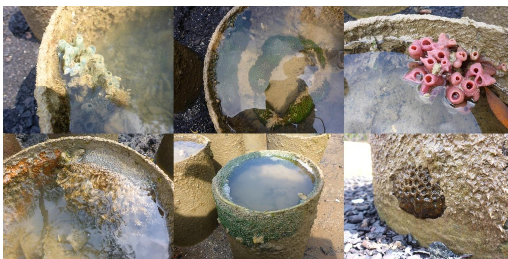
Figs. 6. Marine organisms found inside the empty planter rings at the shoreline protection area.

After the completion of the construction phase, another three rounds of monitoring were conducted in 2012, 2013 and 2016. The continuous monitoring was essential to assess the survival rate of the remaining saplings that were planted, as well as to determine the capacity of the rock revetments in promoting the natural recruitment of mangroves. While the survival rate (3.7%) of the remaining saplings was lower than expected, it clearly illustrated that planting at the right bathymetry level was crucial in ensuring greater survivability of the mangrove saplings. On the other hand, the natural recruitment monitoring showed that there were a large number of recruits of varying species found in the project area. This suggested that the shoreline stabilisation structure provided an avenue for natural recruitment to occur. Some trends were apparent at the site where morphological characteristics of the shoreline and the existence of a cove-like bay also appeared to play some role in facilitating greater levels of recruitment and survival of mature seedling at the site. Interestingly, the natural recruitment did not apply to the mangrove saplings only. During the last monitoring done in 2016, other marine organisms were found inhabiting within or outside the planter rings (Fig. 6).