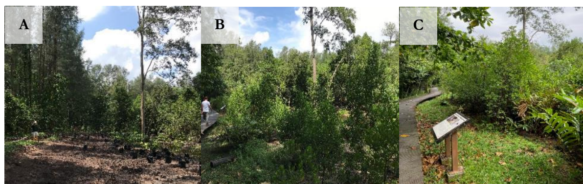
Figs. 21. Progress of the rehabilitated mangrove area as seen through the photos taken at different dates. (A) November 2019; (B) August 2021; (C) June 2023.