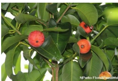
Manggis Hutan ( Garcinia celebica )