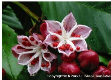
Simpoh Air ( Dillenia suffruticosa )