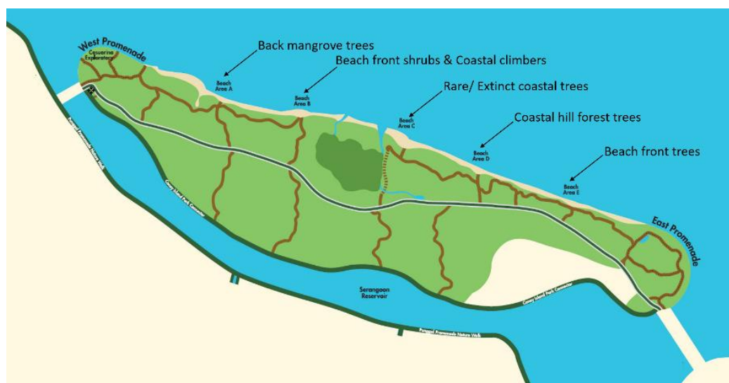
Fig. 3. Location of the five beaches and their themes.

To enhance the floral biodiversity of Coney Island Park, a landscape planting palette was specially curated for various localities on the island. For example, each of the five beach areas in the park was meant to be home to plants of a particular habitat or theme (Fig. 3). The existing vegetation and relationship with sea level were carefully analysed to determine the species of native coastal plants and trees that would be reintroduced into the areas.