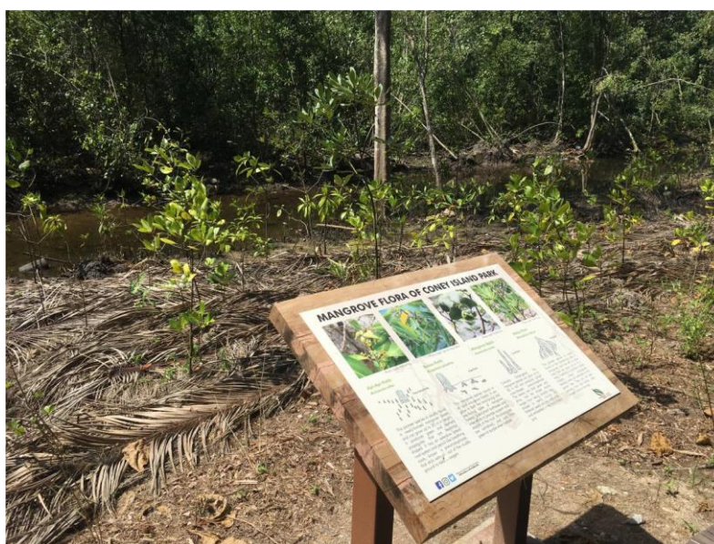
Fig. 20. Installation of educational signs.