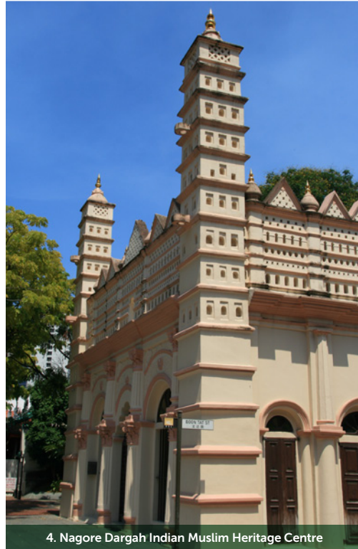
4. Nagore Dargah Indian Muslim Heritage Centre