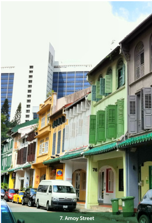
7. Amoy Street