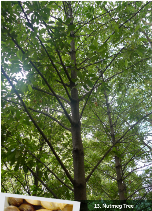
13. Nutmeg Tree

Look out for the Cinnamon Tree in this park. This is a small evergreen tree with oblong-shaped leaves. When young, the leaves are reddish pink, adding colour and vibrancy to the entire tree. Its flowers are greenish in colour and emit a distinct smell. The spice, cinnamon, is obtained from the bark of the tree.