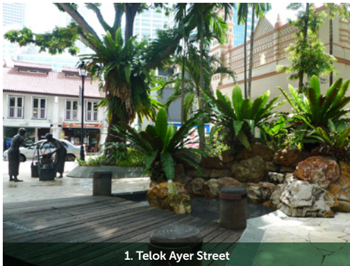
1. Telok Ayer Street