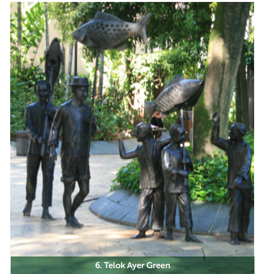
6. Telok Ayer Green

Situated on the corner of this street, this building has been a meeting place and house of worship for Indian Muslims since the 1820s. Look at the interesting architecture of the shrine – it is an unusual blend of classical Western motifs (arches springing from Western-style columns) and Indian influences (the perforated grilles and walls). This shrine was gazetted as a National Monument in 1974.