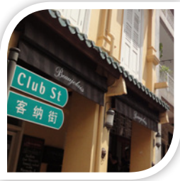
15 Club Street