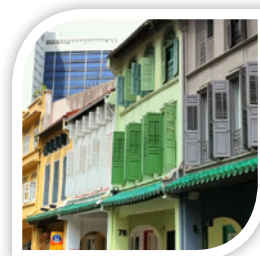
7 Amoy Street