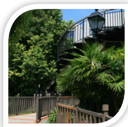
9 Ann Siang Hill Park