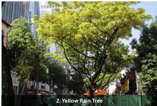
2. Yellow Rain Tree