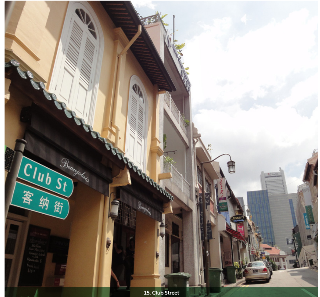
15. Club Street