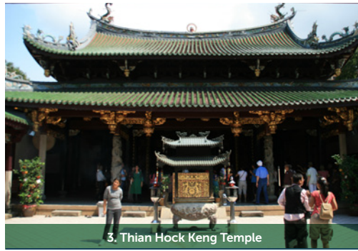
3. Thian Hock Keng Temple