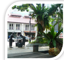
1 Telok Ayer Street