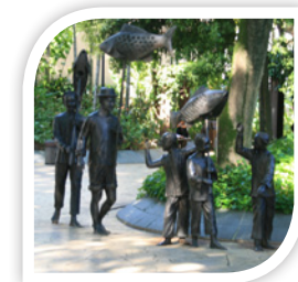
6 Telok Ayer Green