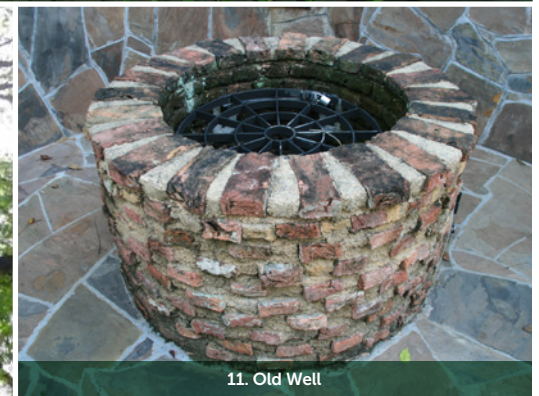
11. Old Well