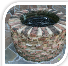
11 Old Well