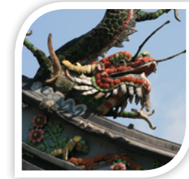
3 Thian Hock Keng Temple