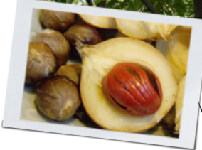
→ Nutmeg Fruit and Seeds