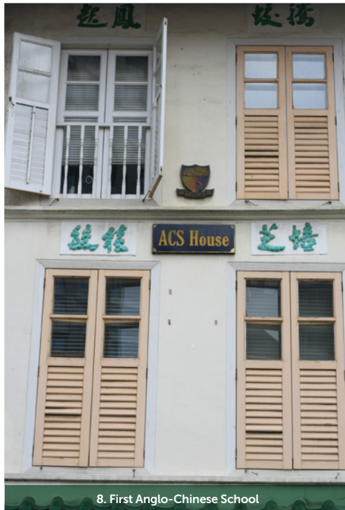
8. First Anglo-Chinese School