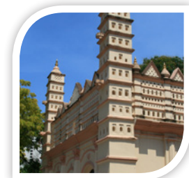
4 Nagore Dargah Indian Muslim Heritage Centre