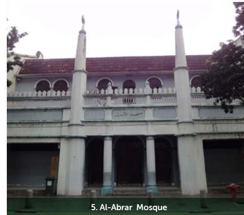
5. Al-Abrar Mosque

The Rain Tree is commonly planted along Singapore's roads for the shade its large, umbrella-shaped crown casts over surrounding areas. Its leaves often fold up at dusk or before a rainstorm, hence its name.