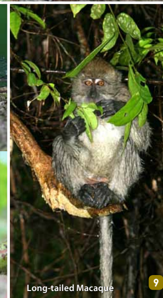
Long-tailed Macaque 9

Look and see if you can spot the St Andrew's Cross Spider ( Argiope mangal ). This spider gets its name for the way it holds its eight legs in pairs to form an X shape. The X is called the St. Andrew's Cross because the saint was martyred on a cross of this shape rather than the conventional "+" shape.