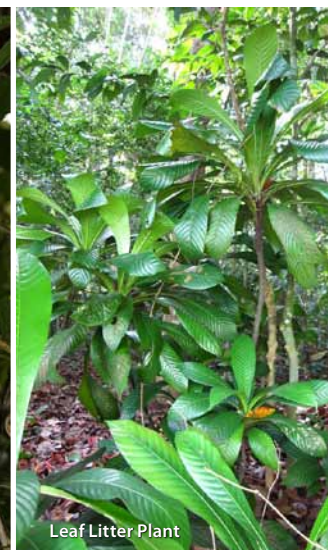
Leaf Litter Plant