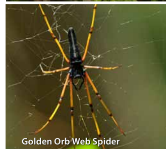
Golden Orb Web Spider