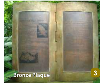
Bronze Plaque 3