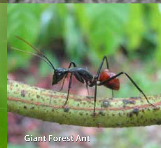
Giant Forest Ant