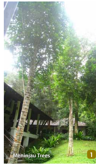
Meninjau Trees 1

As you walk along, do not just look up at the majestic trees. Look down and you can spot the Fan Palm , which grows under the shade of the forest canopy. Its beautiful wedge-shaped fronds radiating from long stalks make it a popular ornamental plant. In the indigenous communities of the Malayan rainforest, the