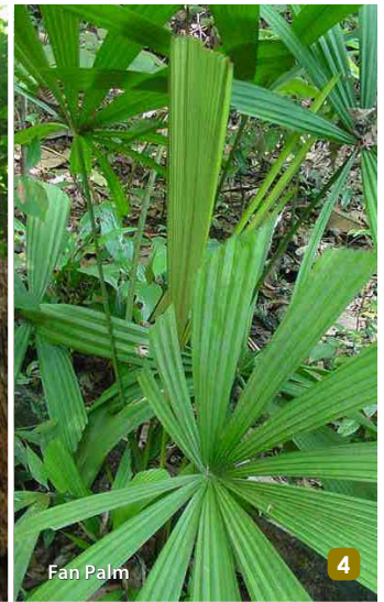
Fan Palm 4