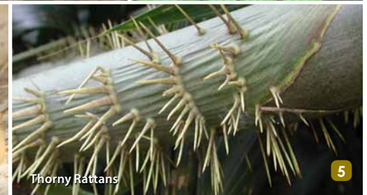
Thorny Rattans 5

Licuala leaves are used to make roof thatches, hats, umbrellas and for wrapping food.