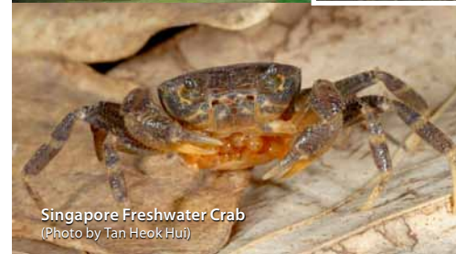
Singapore Freshwater Crab