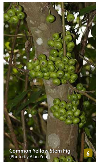
Common Yellow Stem Fig 6

The Golden Orb Web Spider ( Nephila pilipes ) makes the largest and strongest web among spiders. It gets its name from the golden colour of its silk. It has red shiny legs.