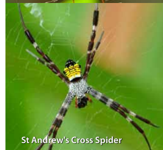
St Andrew's Cross Spider