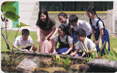
Students from Mee Toh School participated in eco-trails and documented biodiversity during the Biodiversity Week for Schools.