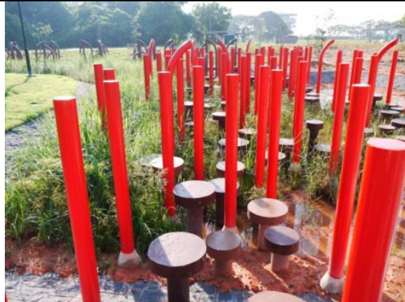
(Junior Adventure Trail)

Young visitors will get to experience what it's like to be a crab or mudskipper in the mangroves. Activities include ducking under prop roots, leaping amongst pencil roots and crossing the mangrove river on a pulley boat. Children under the age of 13 must be accompanied and supervised by adults while exploring the trail.