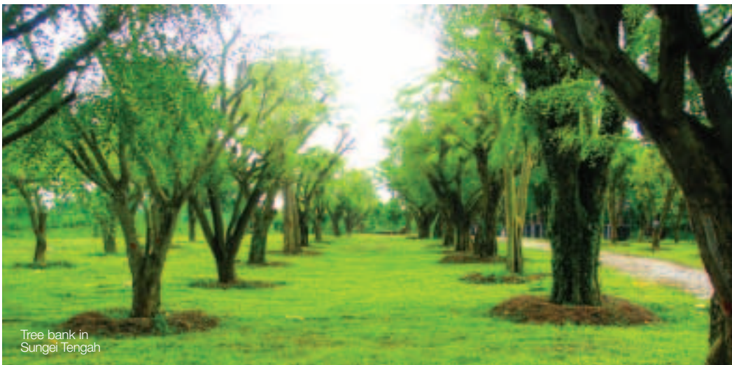
Tree bank in Sungei Tengah

FloraWeb, an online plant reference system featuring more than 1,900 plants found in Singapore, was launched in January 2008. Created in response to the growing interest in nature among Singapore residents, FloraWeb is a source of reference for everyone from gardening enthusiasts to students to professionals in the horticultural and landscaping field.