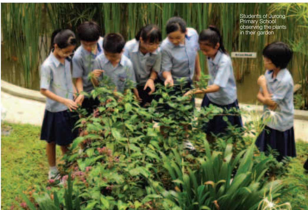
Students of Jurong Primary School observing the plants in their garden

Our next step is to engage young children in gardening through 'Community In Bloom Kidz'.