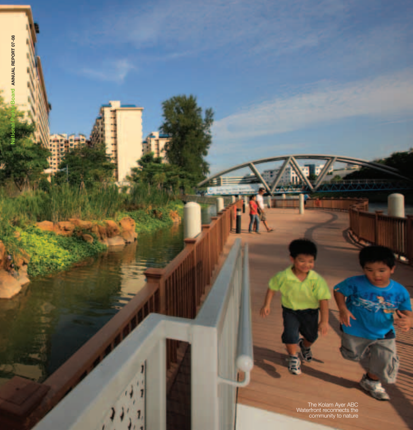
The Kolam Ayer ABC Waterfront reconnects the community to nature