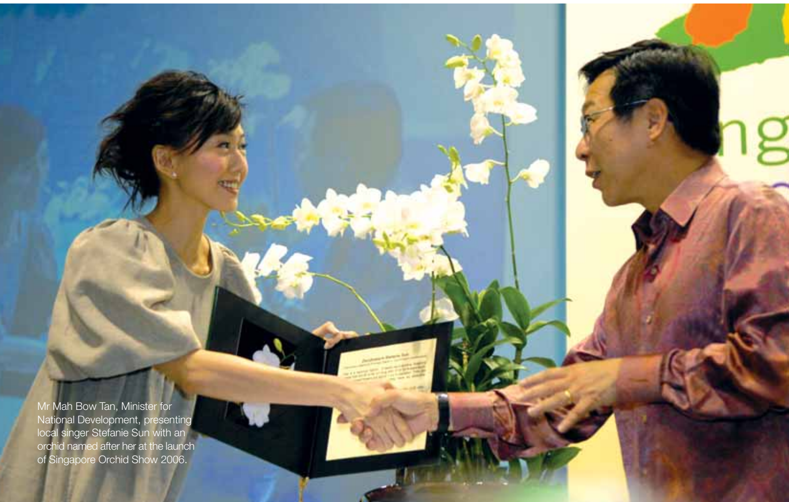
Mr Mah Bow Tan, Minister for National Development, presenting local singer Stefanie Sun with an orchid named after her at the launch of Singapore Orchid Show 2006.

The inaugural showing of Singapore’s largest international garden and flower festival was executed with great success from 16 to 25 December 2006. The Festival united top award-winning landscape designers from around the world and Singapore’s brightest talents.