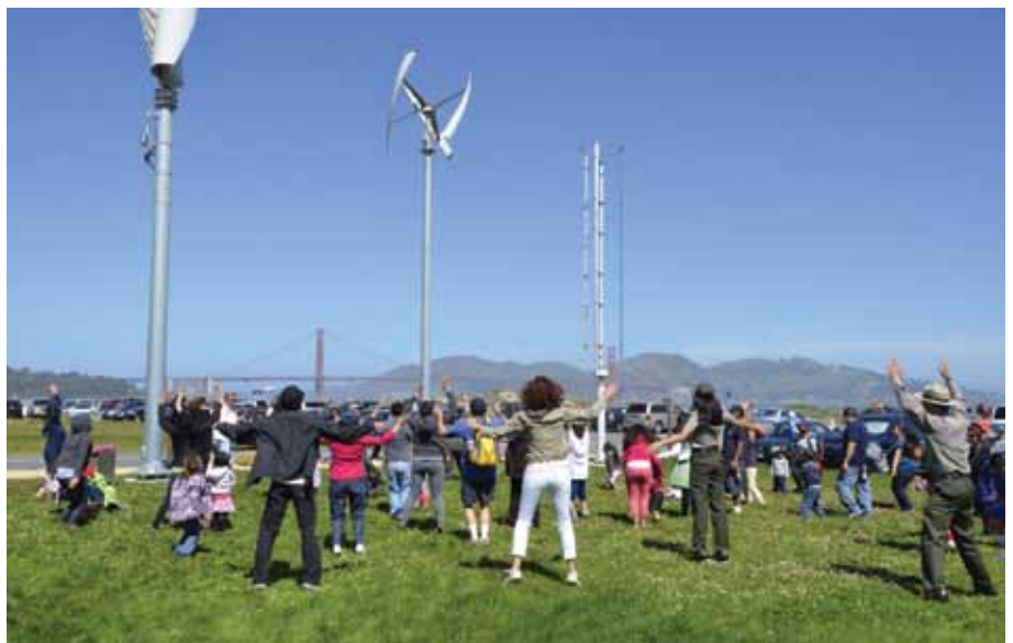
3. Kick-off programme at Crissy Field in the Golden Gate National Recreation Area.