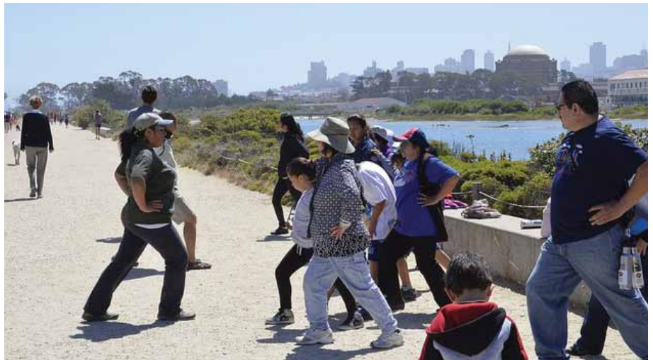
2. Kick-off programmes take place in all nine Bay Area Counties on the first Saturday of every month.