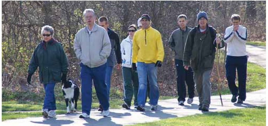
1. Walk with a Doc in Columbus, Ohio. Walk with a Doc is a free, year-round, international walking programme, which starts with a presentation by the physician on a health-related topic, followed by a 30- to 45-minute walk, and concluding with a blood pressure check.

a free, year-round walking programme that operates in more than 100 communities across America and internationally, including Canada, India, United Arab Emirates, and Russia. One hour a week leads to healthier, more active behaviours among patients. The programme begins with a presentation provided by the physician on a health-related topic, followed by a 30-45 minute walk, and concludes with a blood pressure check. As a result of the programme, 90.8 percent of participants felt they were more educated, 75.2 percent exercise more, and 70 percent felt more empowered.