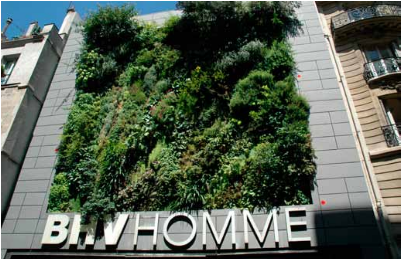
ABOVE In the higher reaches of our cities, the façades of BHV.Homme in Paris also harbour nature by design.

There are also a host of research questions that relate to how effective our biophilic strategies in fact are—what are the most effective planning and policies means for getting people outside? What will it take to nudge urban populations to adopt a more outdoor nature-oriented lifestyle? As well, our very understanding of the science and ecology of cities remains quite limited and there is much work to be done here as well. New research is needed to better understand the biology and lifecycles of fauna found in cities and how it changes or is modified in an urban setting (e.g., think of coyotes!), as well as the management implications therein. There are many, almost countless, research questions and opportunities that arise from the agenda of biophilic cities.