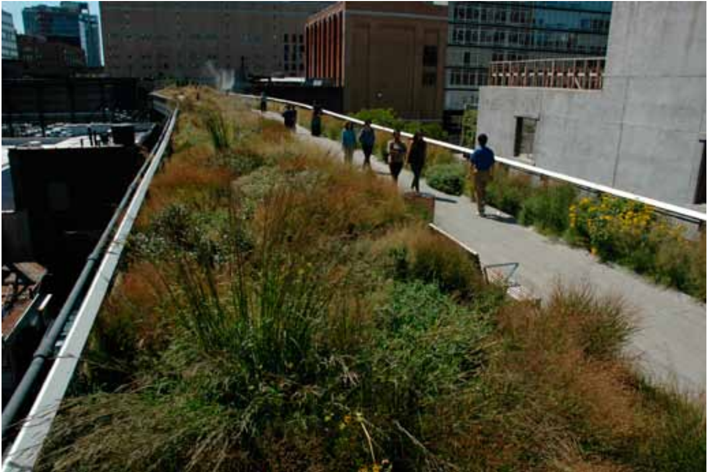
ABOVE The High Line, New York City's Innovative New Elevated Park.

many environmental and economic values provided by nature and natural systems.