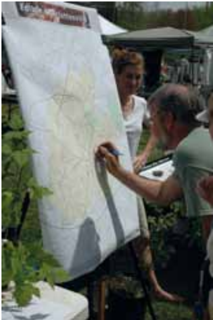
BELOW Activities of "friends" of the canyons groups in San Diego.

This enjoyment and engagement can take many different forms, of course, from walking and hiking in natural areas, to bird-watching and plant and tree identification, to organised nature events and activities, from fungi forays to nature festivals.