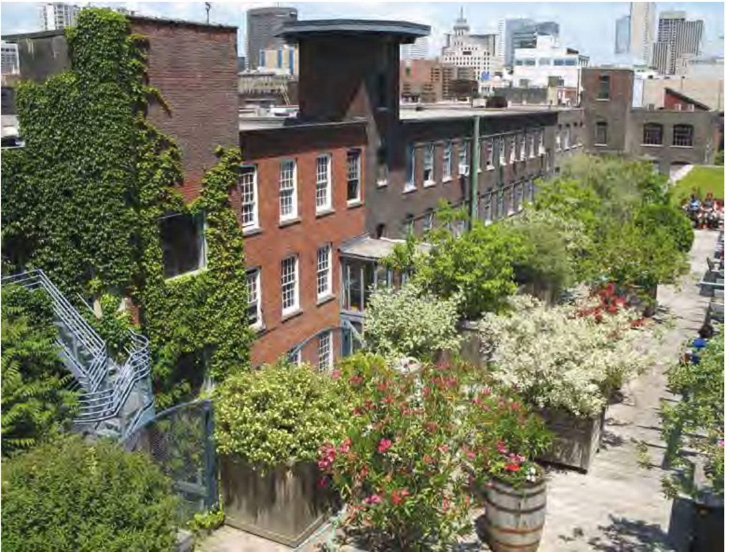
ON THIS SPREAD AND THE NEXT The roof garden at 401 Richmond St. W. is a hot spot for birds, bees and butterflies.