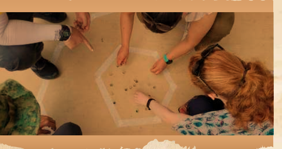
In goli panjang, players try to knock the opponents' marbles out of the circle to claim them. The player who claims the most marbles win

Pesta Ubin 2022 also saw the return of a wide range of exciting on-site activities. Participants enjoyed kampung games such as gasing (top spinning), goli panjang (marbles), hopscotch, and chapteh (shuttlecock kicking). They also immersed themselves in Ubin's living heritage through tours and community treks, and attended exhibitions and guided walks that offered a window into Ubin's rich biodiversity. For the organisers, it was a long-awaited opportunity for a homecoming, and to finally meet in person through Pesta Ubin.