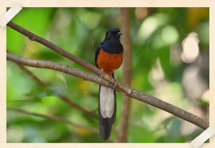
White-rumped Shama

The White-rumped Shama ( Copsychus malabaricus ) is a beautiful songbird with a melodious call. This bird is now commonly sighted on Pulau Ubin due to increased connectivity between forest patches from reforestation efforts to link its habitats.