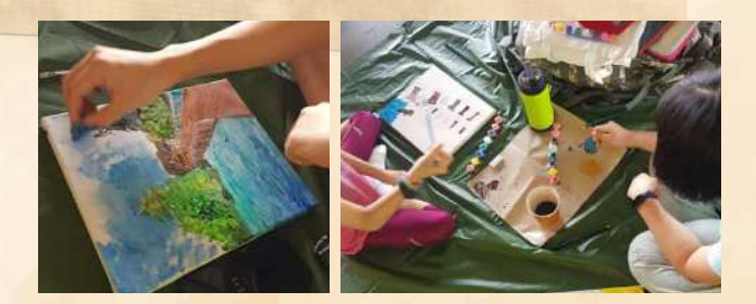
(Left) A participant "colouring the coasts of Chek Jawa" with a sponge; (Right) The children painting their experience at Chek Jawa Wetlands

To conclude the guided walk, participants translated their trail experience at Chek Jawa Wetlands into a family painting under the guidance of facilitators who also shared new painting techniques using unconventional materials, such as sponges and forks.