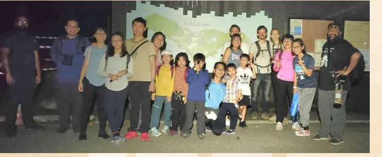
Families had a great time bonding with one another while looking out for wildlife that comes out in the dark

It was inspiring to see everyone enthusiastically contributing to the vibrancy of Pesta Ubin, which bodes well for future editions of the festival!