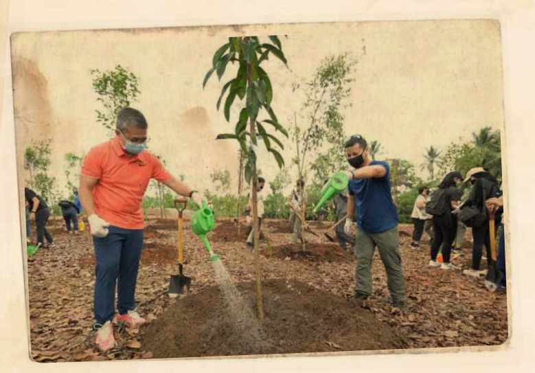
Minister Edwin Tong (left) and Minister Desmond Lee (right) watering the tree they planted during Ubin Day 2022

Engaging the community is key to the success of the OMT movement. Since 2020, Pulau Ubin has welcomed the contribution of more than 20 community groups towards the efforts for a greener future.