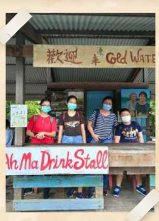
Participants visited Ah Ma Drink Stall

Want to join us for the workshops too and learn more about Pulau Ubin? Look out for these workshops on the <u>NParks</u> <u>Events and Activities Page</u>!