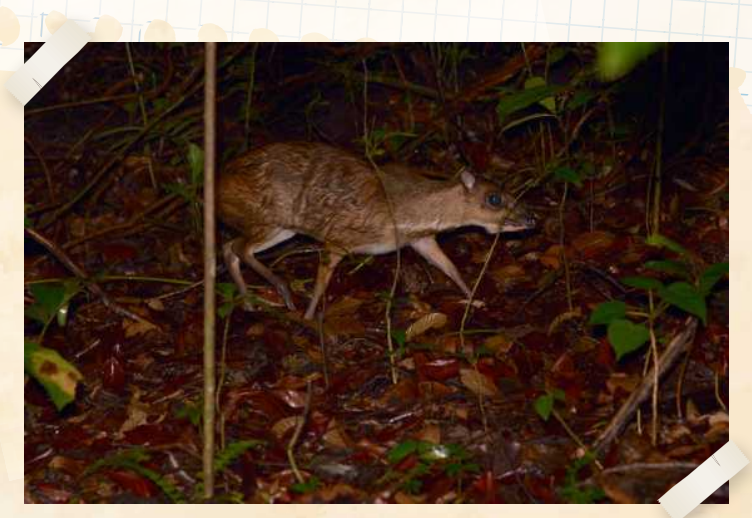
Greater Mousedeer

An elusive mammal, the Greater Mousedeer ( Tragulus napu ) is the only species of mousedeer found on Pulau Ubin. It has been spotted in the understorey at reforestation sites around the island. As this mousedeer is not typically found in open areas, restoring canopy cover through the OMT movement will allow it to move around easily and hopefully help to increase its population.