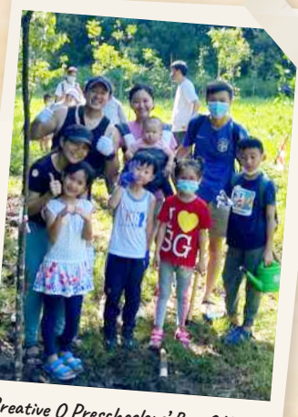
Creative O Preschoolers' Bay OMT Planting at Coastal Arboretum

Currently, reforestation efforts and habitat enhancement programmes are ongoing at Pulau Ubin that will see some 30,000 trees of over 200 native species planted from 2020 to 2030 in support of the OMT movement.