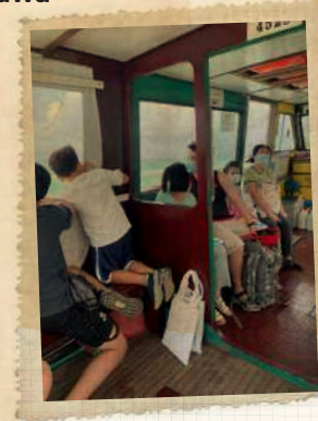
Participants excited to take a bumboat for the very first time

The day began with participants of the "Colouring the Coasts of Chek Jawa" workshop arriving at Changi Point Ferry Terminal to meet the facilitators from Better Trails. For many, it was their first time taking a bumboat! Soaking up the sun and enjoying the sea breeze, participants soon arrived at Pulau Ubin and started the tour with a visit to Chek Jawa Wetlands to learn about its inspiring conservation story and rich biodiversity.