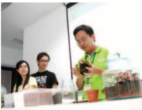
Learn to create your own terrarium or bottled garden

Admiralty Park, which launched a 20-hectare nature area on 4 October 2008, has also introduced a new nature appreciation walk that takes visitors through the secondary rainforest and mangroves. The tour is held on the second Saturday of every month.