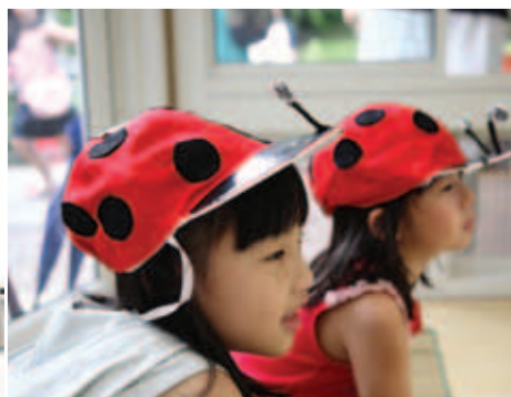
The Children's Garden caters to kids up to 12 years