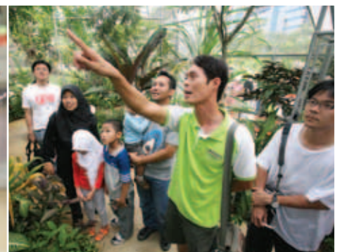
HortPark's Butterfly Garden Tour is held once a month