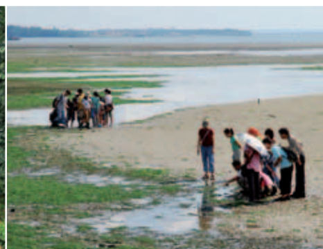
Chek Jawa Wetlands is home to six ecosystems