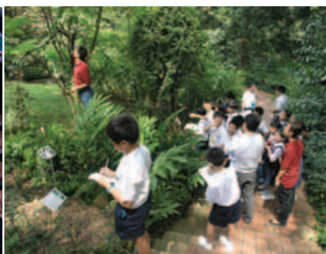
The Spice Garden in Fort Canning Park has over a hundred plant species