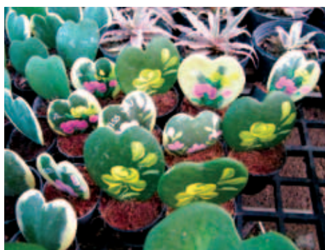
Expressions of love on the Sweetheart Hoya

Nature talks were also held regularly. The “Singapore Biodiversity Talk Series” was organised by NParks’ Conservation Division to give the public an insight into Singapore’s natural heritage. Singapore Botanic Gardens continued to run “The Gardens’ Talk Series” which touches on fascinating plants like Rhododendrons, Begonias and Orchids.