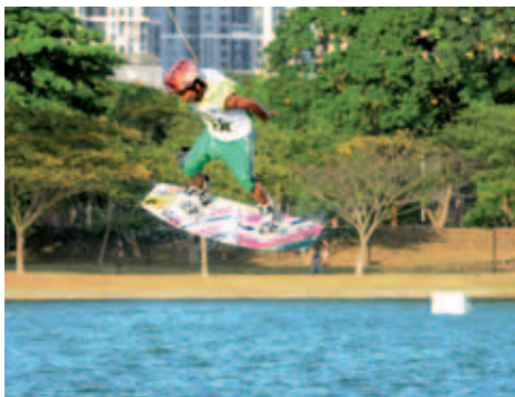
Cable ski makes water sports fun and affordable

In collaboration with arts group, Players Theatre, NParks kicked off the fifth series of PLAYing in the Park with a children's play based on bestseller "If You Give a Mouse a Cookie", which was staged at East Coast Park, Pasir Ris Park and West Coast Park.