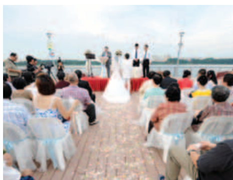
A floating wedding at Bedok Reservoir Park

To keep in touch with our users, we have also created a social networking group on Facebook called "Let's Make Singapore Our Garden".