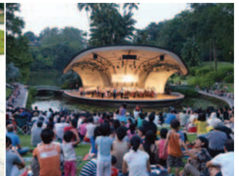
A lyrical evening at the Shaw Foundation Symphony Stage in the Botanic Gardens