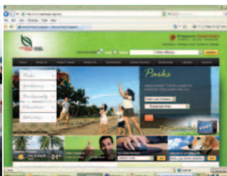
Get the latest news from NParks' website