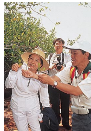
right A joint project by NParks, the National Environment Agency and Southwest Community Development Council, the greening of Pulau Semakau with coastal tree species was graced by Mrs Yu-Foo Yee Shoon, the Minister of State, Community Development, Youth and Sports 10 .