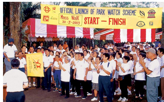
top The Park Watch Scheme at Ang Mo Kio Garden West is one of the six launched in 2003.

As with previous years, outreach and education on environmental awareness were the main theme during Clean and Green Week (CGW) 2003 which was launched by Prime Minister & Finance Minister 9 Lee Hsien Loong at Zhenghua Square. As a joint organiser of the CGW, NParks planned some 170 activities and events during the week to promote nature appreciation and environmental awareness. These events include Adopt-A-Park activities, guided nature walks, reforestation, beach cleansing and park performances. One of the