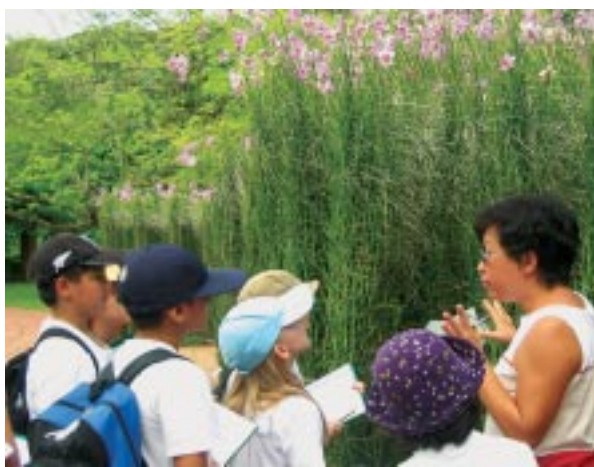
top More than 2,000 visitors benefitted from volunteer-led tours in the Singapore Botanic Gardens this year.

The Botanic Gardens also continued to engage the community through its various volunteer activities. The Gardens now offers free guided rain forest tours for the public conducted by volunteers in English, Mandarin and Japanese. Volunteers also conduct monthly tours to the National Orchid Garden. In FY2003, more than 2,000 people benefitted from these volunteer-led tours. Volunteers are also involved in gardening works, providing visitor assistance at the information counter and even helping in the design of publicity materials for the Gardens' activities.