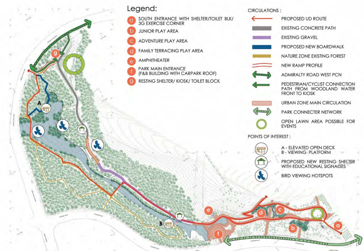
Proposed Overall Layout and Circulation Diagram.