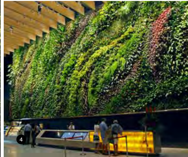
2-4. The Rainforest Rhapsody, a 2000-square-foot vertical green wall at Six Battery Road uses 120 species of plants native to Singapore and the surrounding region.