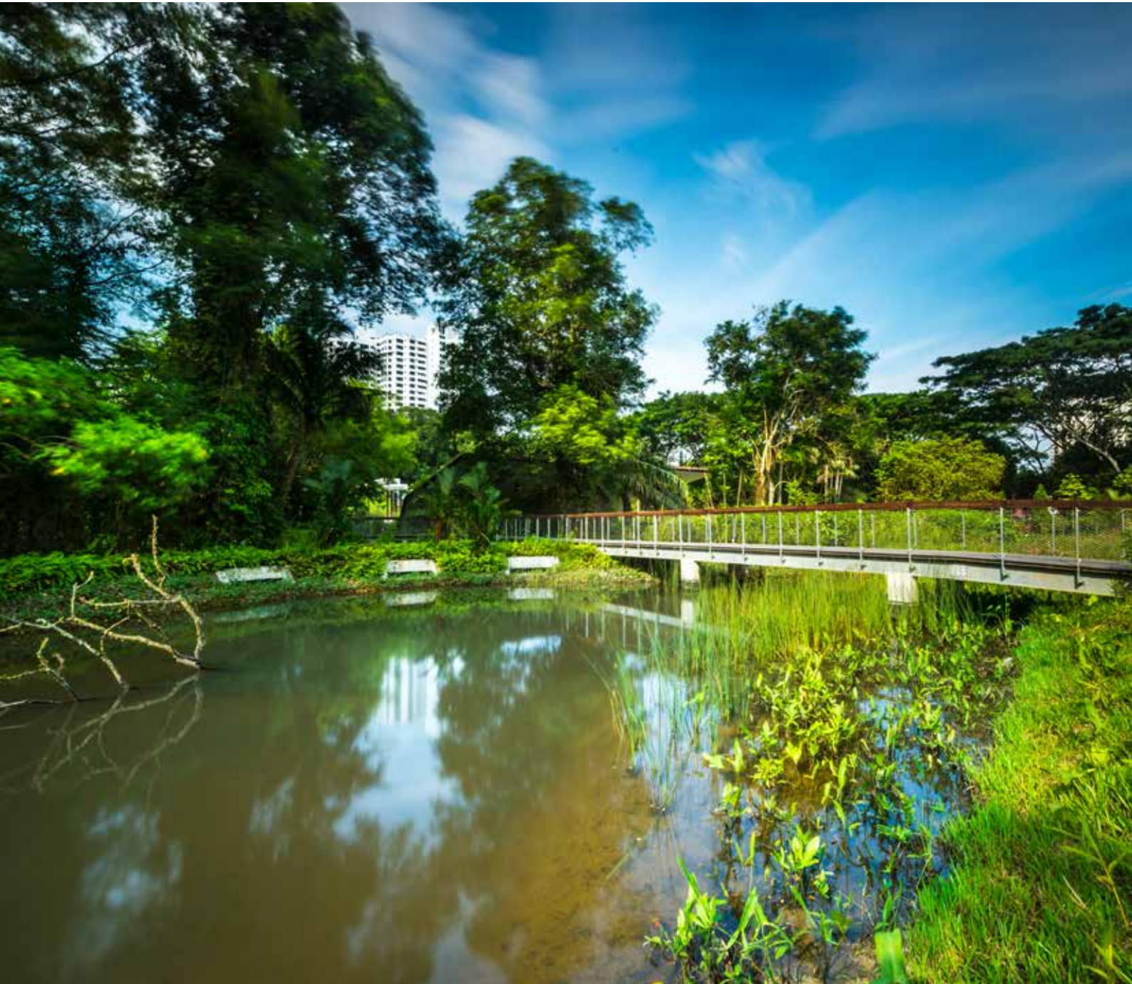
The Windsor Nature Park is established on the margin of the Nature Reserve to act as a green buffer, as well as to connect land-based urbanites with their natural environments. Image by Tuckys Photography, commissioned by Landscape Engineering Pte Ltd