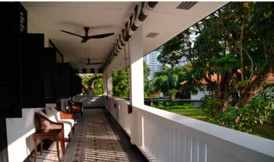
The unique architectural elements of the colonial bungalows were carefully restored.