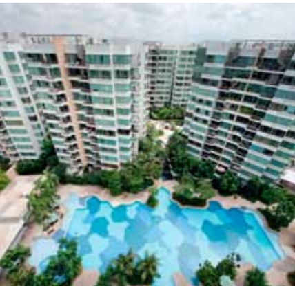
The Casa Merah Condominium's landscape pattern language takes reference from red earth or soil.

Casa Merah Condominium's clever use of terraces and change in level conveys a strong sense of space. The Tanah Merah or Red Soil concept is present throughout the detailing and design of the space. The judges applaud the originality and distinctive identity the design intent has brought to the site.