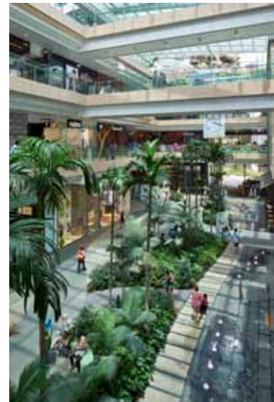
By placing greenery in Westgate, mall-goers can enjoy nature while shopping.

The Westgate project proves to be a contemplative piece that seeks to redefine the outside-inside boundary of greenery. The execution of its green wall is a stunning attempt at softening the building that it sits within. The narrative of its design extends beyond the conventional implementation of mere planting.