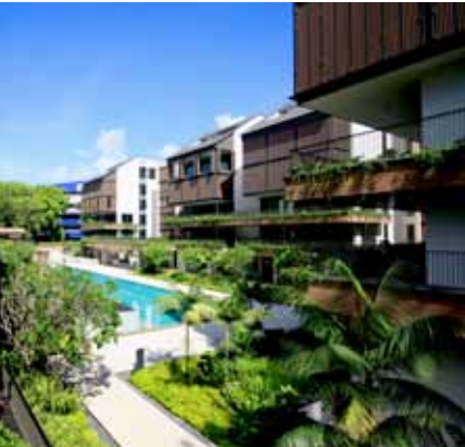
The Nassim has a simple planting palette that is effective and elegant.

The Nassim's simple planting palette is effective and elegant. The use of the grand trees enhances the space and softens the void between buildings and outdoor spaces. Lush but settled, it demonstrates a mastery of planting that is well selected through its layered planting strategy. It can be described as simplicity and tactility at its best.