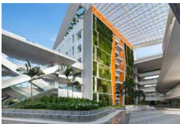
ITE Headquarters and College Central creatively includes a variety of landscape features.

Four Acres Singapore's use of landscape has greatly enhanced its architectural and interior spaces. Its design harmoniously balances conservation efforts and the introduction of new spaces. The choice of planting, set amidst black and white bungalows and the nearby tree conservation area, reflects the consideration of context.