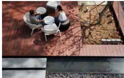
Surrounded by lush greenery, the BASF Learning Campus' outdoor spaces can be used as a learning space.