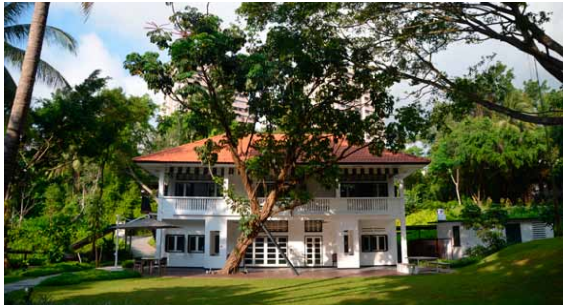
The BASF Learning Campus is surrounded by a natural landscape, which was preserved and curated during its restoration project.