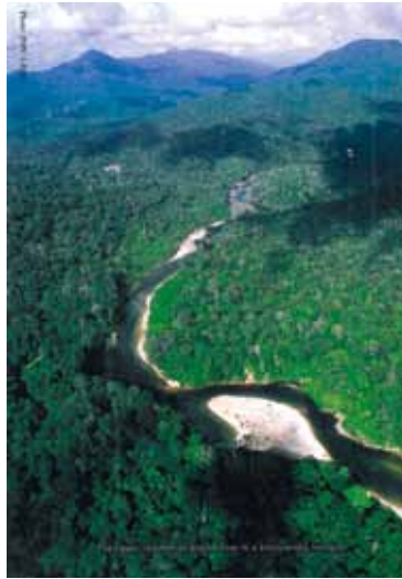
An Environmental Framework for the Sustainable Future of Endau Rompin delivers an important ecosystem service to the local community.