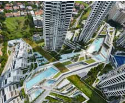
The central spine of D'Leedon strongly articulates the diversity of activities.

D'Leedon presents a high level contemporary ensemble of design features that translates into a sophisticated integration of both landscape and architecture. The judges are impressed that the use of landscape was not only set as a "mise en scène" for the building. The central spine strongly articulates the diversity of activities while creating a readable spatial scale at ground level.