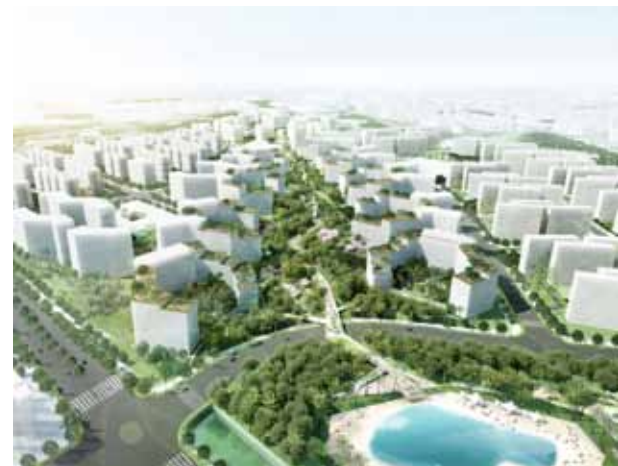
New Town Public Housing, Tampines focuses on sustainability and liveable landscape spaces.