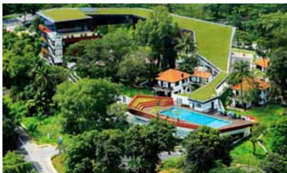
Four Acres Singapore's design balances conservation efforts and introduction of new spaces.