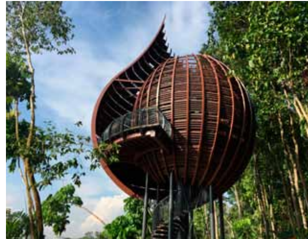
Sungei Buloh Wetland Reserve provides a conducive setting for learning.

New Town Public Housing, Tampines focuses on sustainability and liveable landscape spaces that are derived from a series of urban greenery strategies. By respecting the site's local character and considering the total living environment, it enhances the economic value of the area. The creation of a natural and open environment within the seemingly urban setting brings value and benefit to its residents.