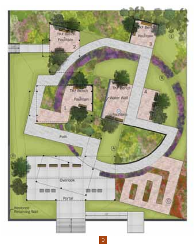
Landscapes of Resilience: Plan of the Butterfly Garden and Overlook at Cunningham Park in Joplin, Missouri