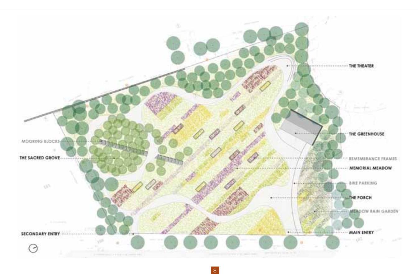
Naval Cemetery Landscape: Plan for the upcoming Navy Yard Hospital Memorial Landscape in Brooklyn (Image: Nelson Byrd Woltz Landscape Architects)

The results of this research could have far-reaching implications for a variety of expensive and debilitating health issues, such as cancer and heart disease. Nature may prove to be a low-cost way to prevent and treat illnesses.