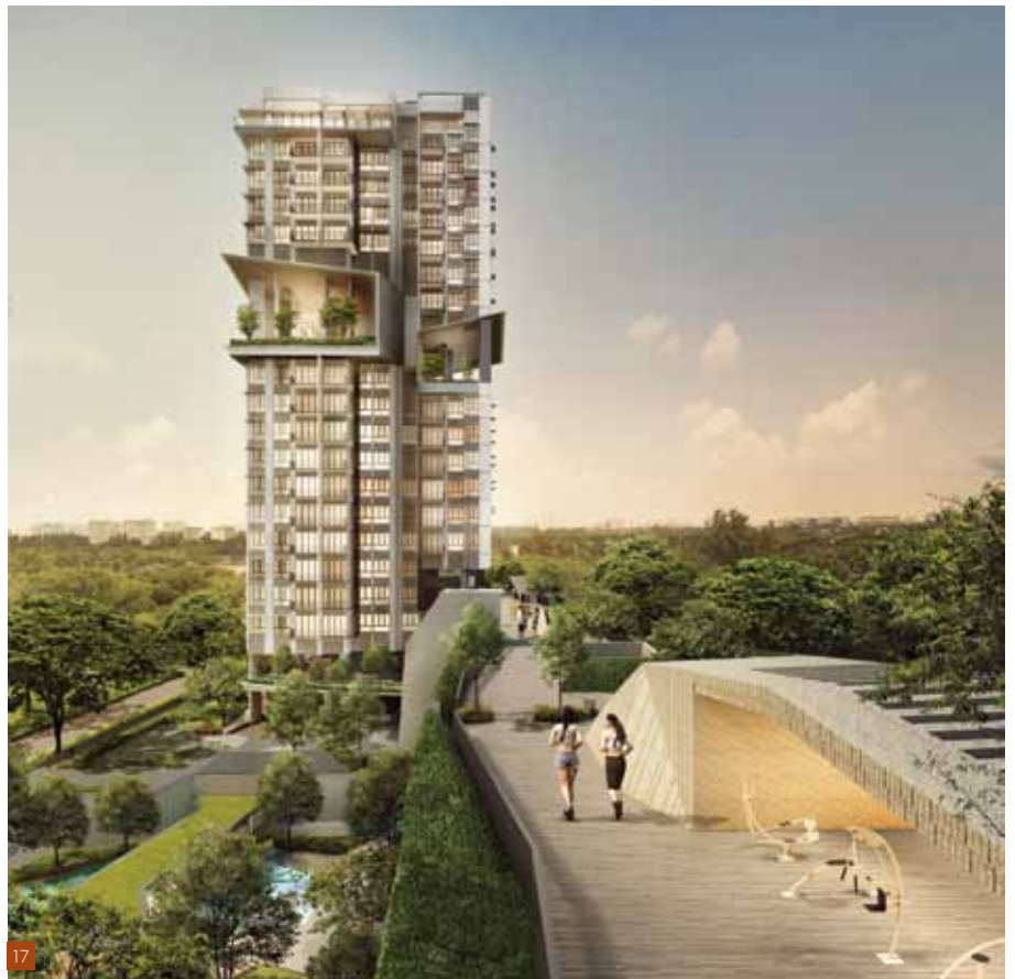
16, 17. Highline Residences features an elevated green ridge on level five, which will host recreational facilities and connect seamlessly with the landscape on the ground floor (Image: Keppel Land Limited).