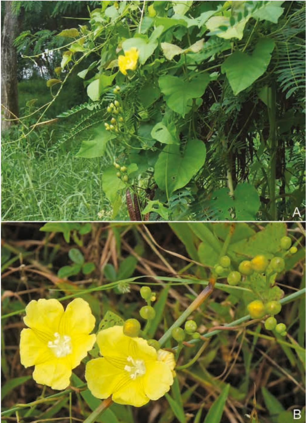
Fig. 3. Merremia gemella (Burm.f.) Hallier f. A. Habit. B. Flowers. A from Lua et al. SING2012-431 , photographed in Buangkok Crescent; B from Bulim.