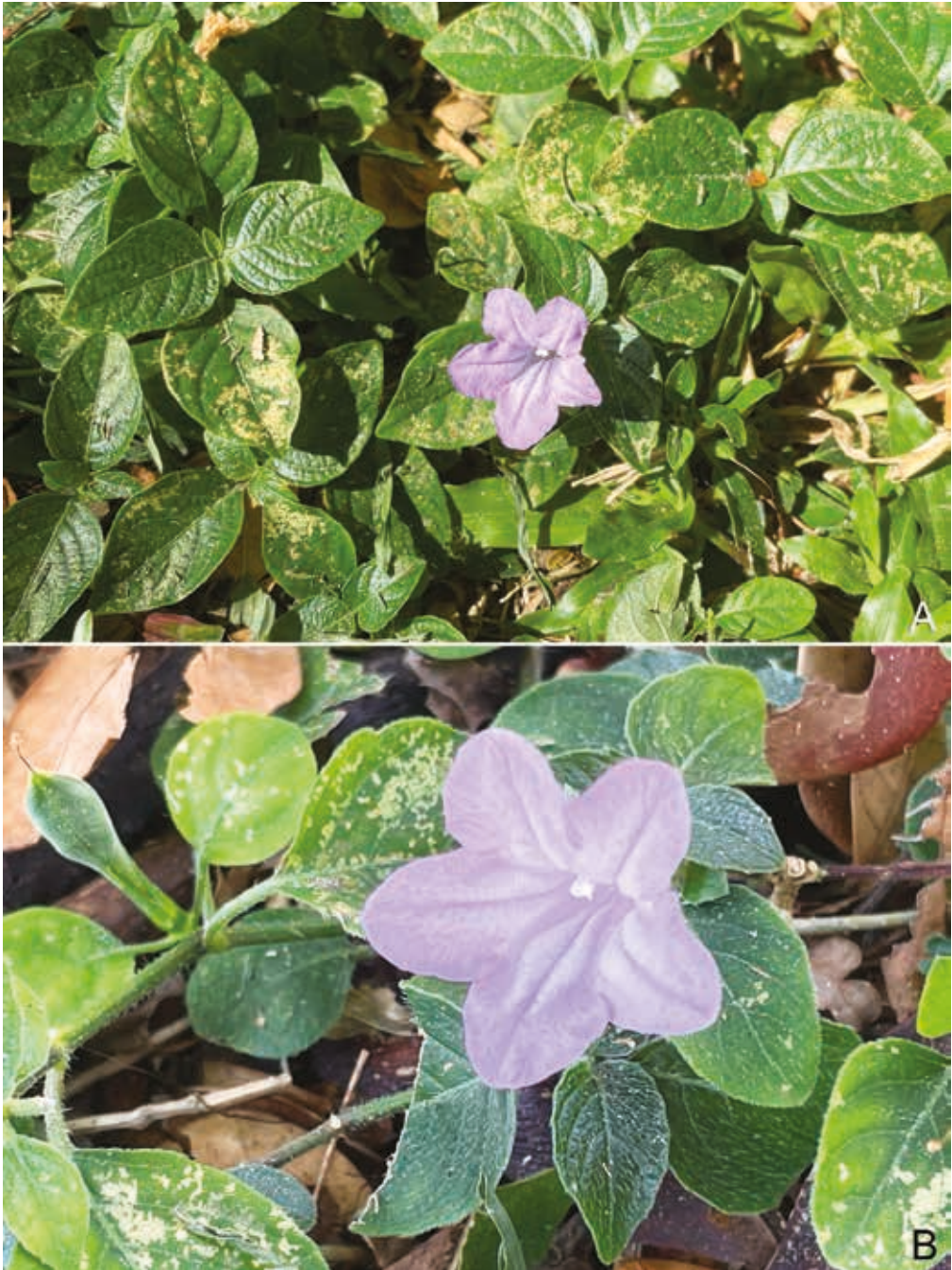
Fig. 2. Ruellia prostrata Poir. A. Habit. B. Close up of flower, with a green fruit on the left. All from Chen et al. LCMJ 2021-010, photographed at East Coast Park.