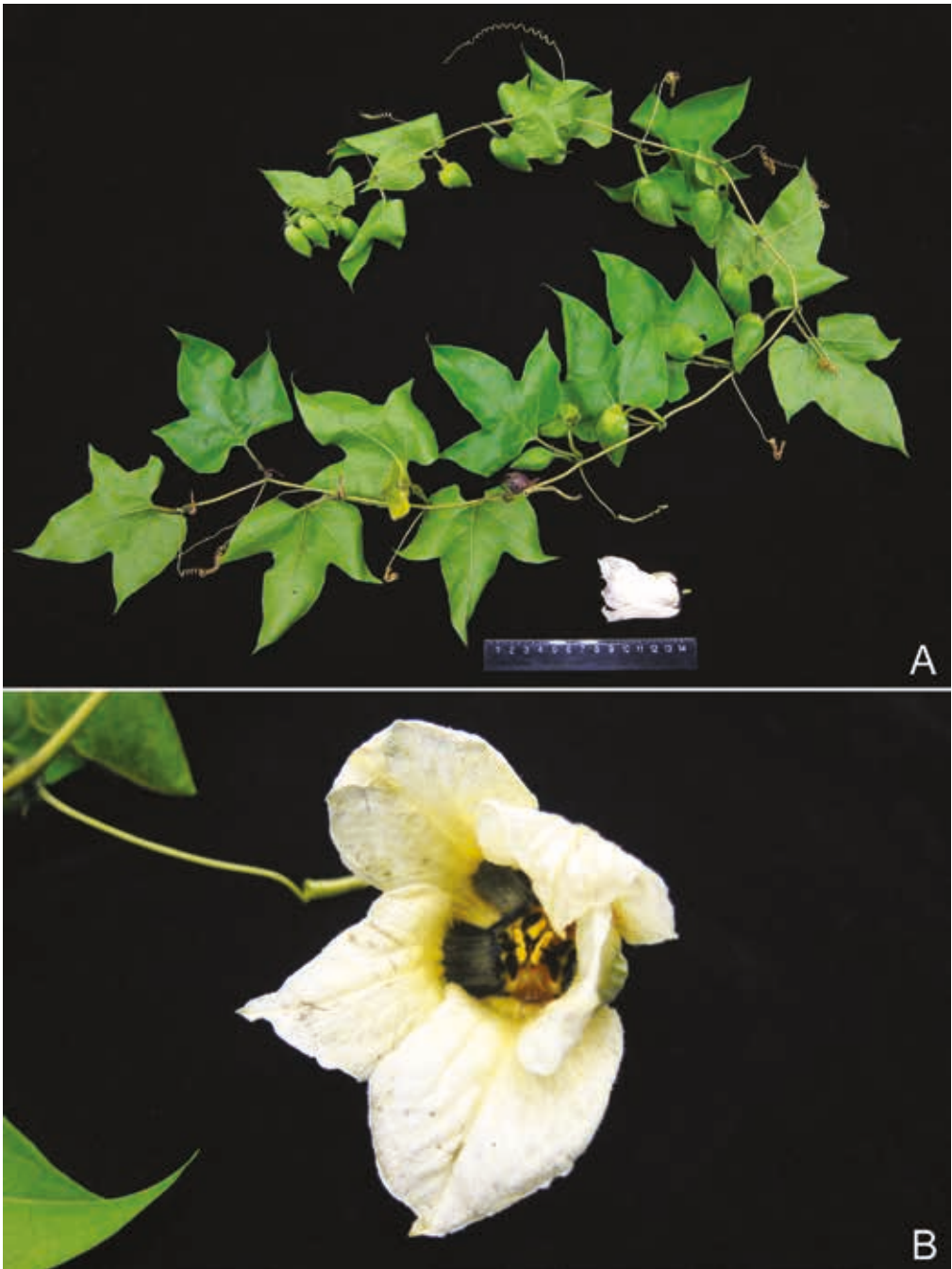
Fig. 4. Momordica cochinchinensis (Lour.) Spreng. A. Flowering shoot and a detached flower. B. Close up of opened flower. All from Boo LCMJ 2021-041 collected from Lim Chu Kang.