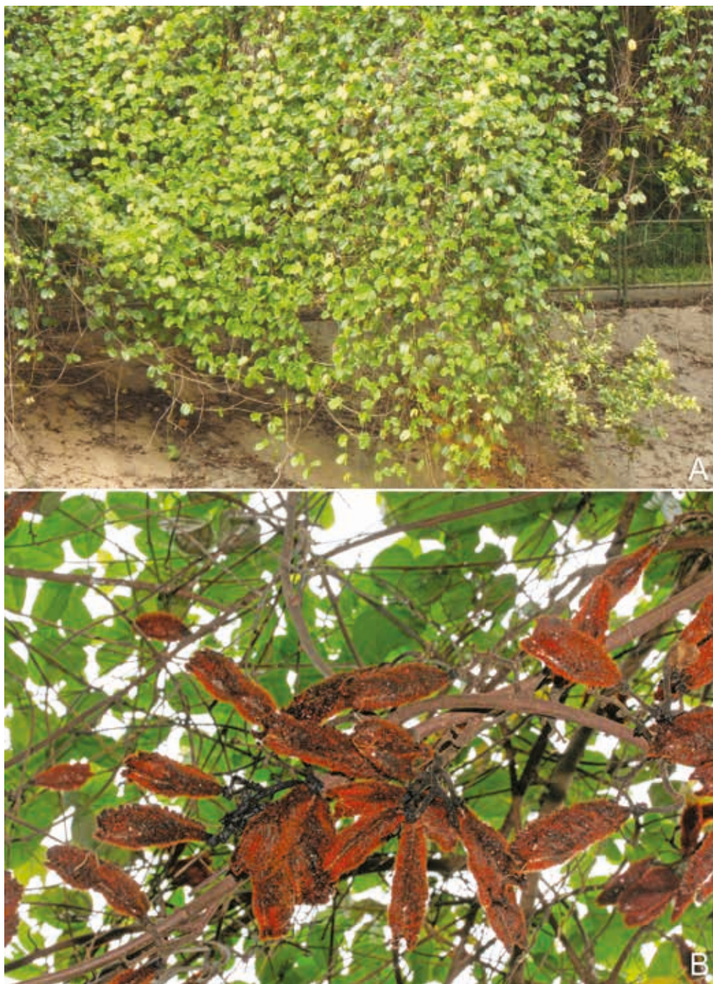
Fig. 1. Mucuna biplicata Teijsm. & Binn. ex Kurz. A. Habit. B. Pods on twining stems in the canopy. All from Lua SING2017-005 .