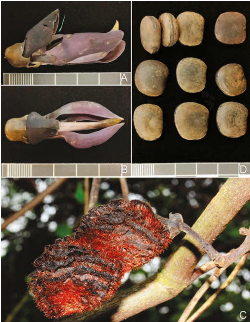
Fig. 3. Mucuna biplicata Teijsm. & Binn. ex Kurz. A. Flower from side view. B. Flower from dorsal view. C. Maturing pod with abundant reddish-brown irritant bristles. D. Seeds, chocolate brown, each with a long hilum. A, B, D from Lua et al. SING2022-251; C from Lua SING2017-005.