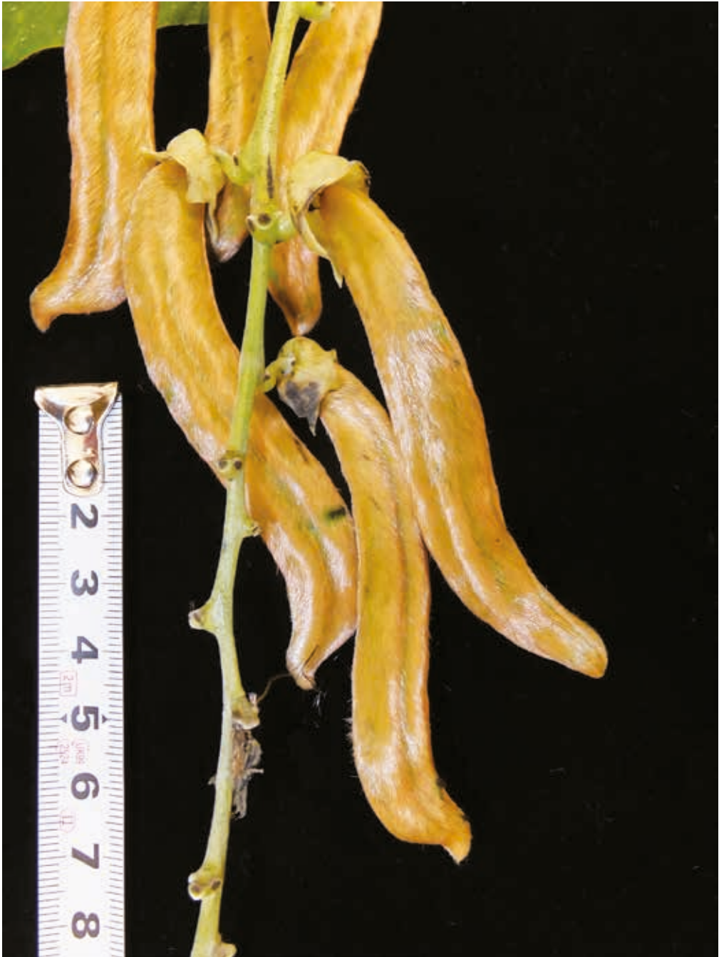
Fig. 8. Mucuna pruriens (L.) DC. var. pruriens . Close-up of sigmoid fruit pods with longitudinal ribs and a hooked apex. Note surface of pod coated with dense yellowish brown irritant bristles. From Lua & Ho SING2017-006.