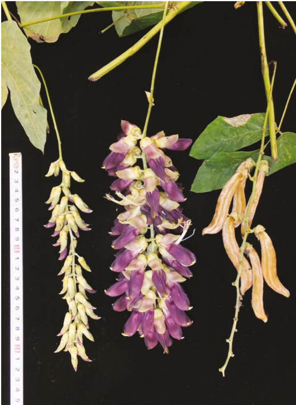
Fig. 7. Mucuna pruriens (L.) DC. var. pruriens . Inflorescence at different stages (from left to right: flower buds, opened flowers, fruits). From Lua & Ho SING2017-006 .