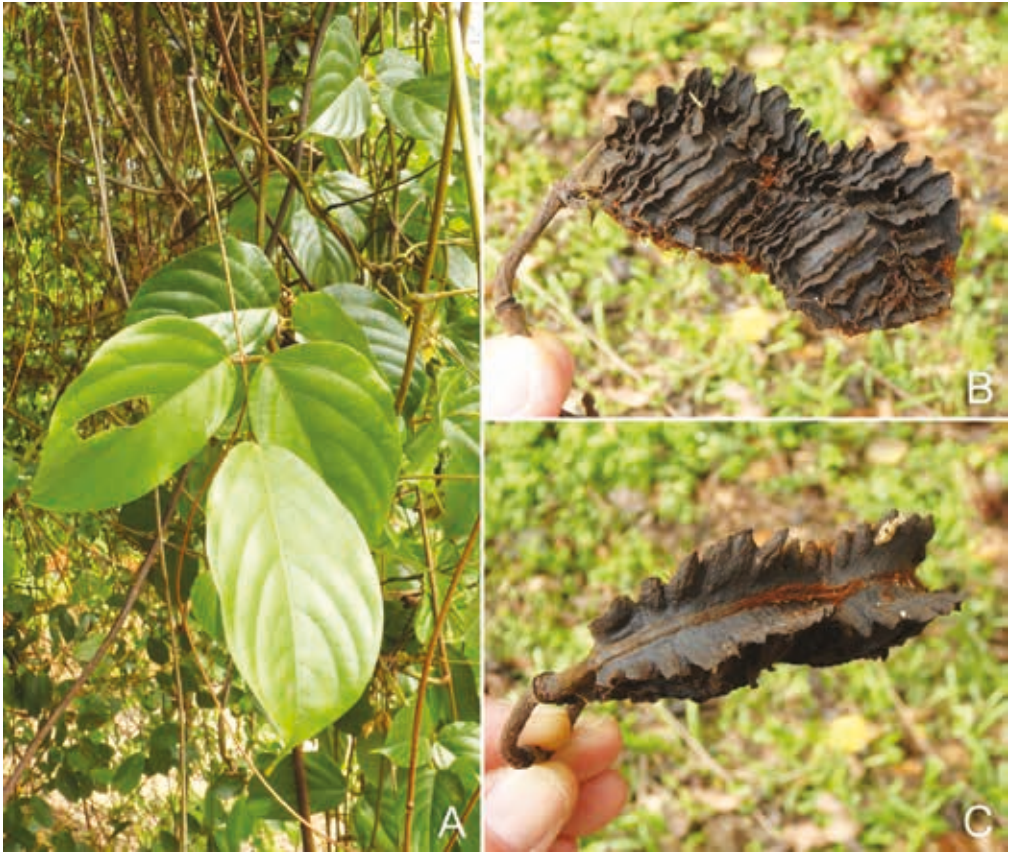
Fig. 2. Mucuna biplicata Teijsm. & Binn. ex Kurz. A. Trifoliolate leaf with long leaflet tips. B. Mature pod from side view showing the typical surface lamellae. C. Mature pod from dorsal view showing wings along suture. All from Lua SING2017-005 .

sparse short golden-brown hairs and abundant reddish-brown irritant bristles, bristles c. 2.5 mm long, erect. Seeds 1–3 per pod, chocolate brown, 14–18 × 13–15 × 8–9 mm, hilum extending c. 3/4 of circumference.