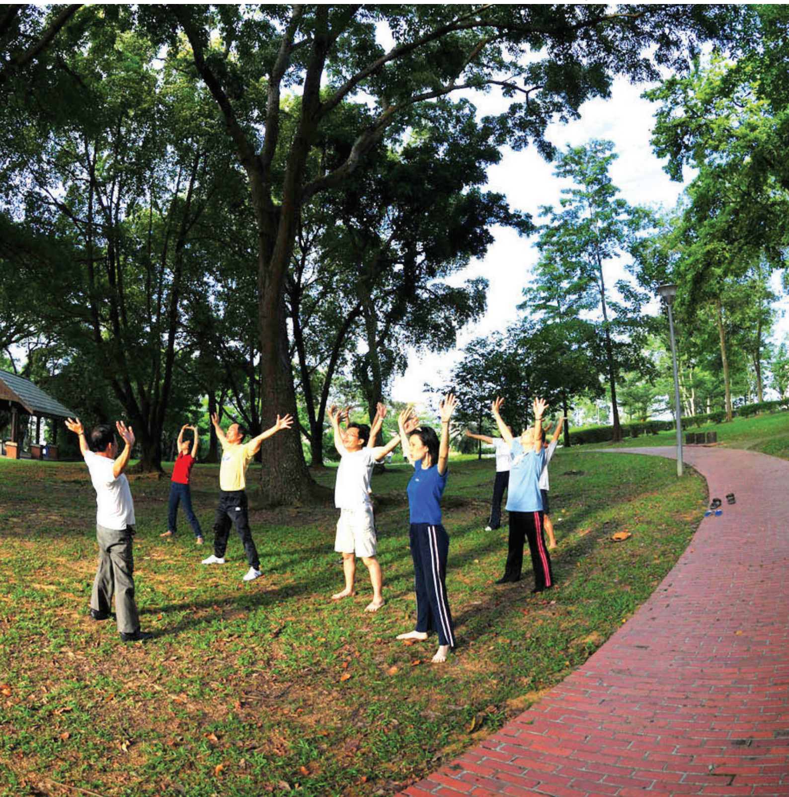
Ang Mo Kio Town Garden East