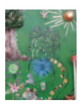
Our Day Out Kranji Secondary School: Group of 1B students We have tried to depict a family of three having a day out at the park. We used recycled materials for most of the elements in this collage.